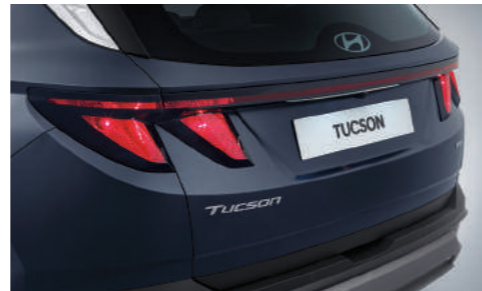
Rear Combination Lamps (Bulb Type)