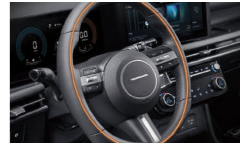
Heated Steering Wheel