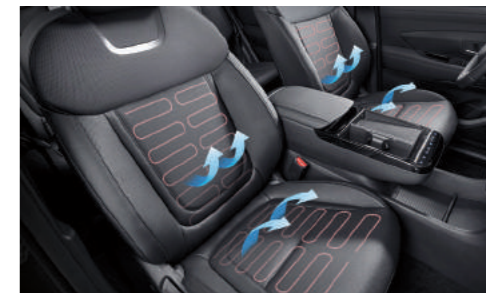
Front Heated and Ventilated Seats