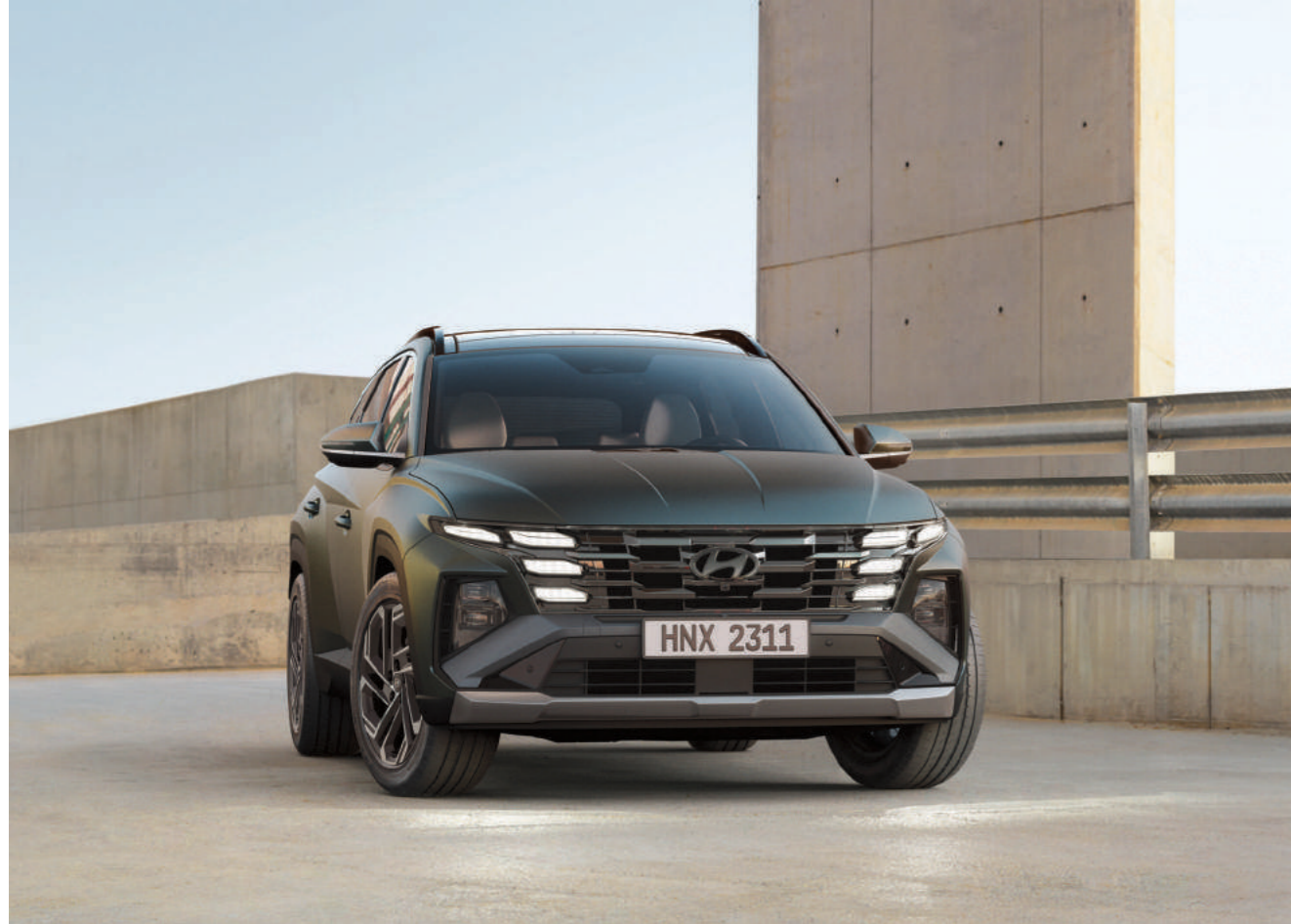
Parametric Jewel Hidden Signature Lamps / Radiator Grille / Front Bumper

Reject the ordinary with eye-catching jewel-like elements of the front lamps as well as around the sides - boldly upgraded to allow you to stand out from the crowd.