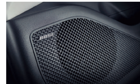
BOSE Premium Sound System