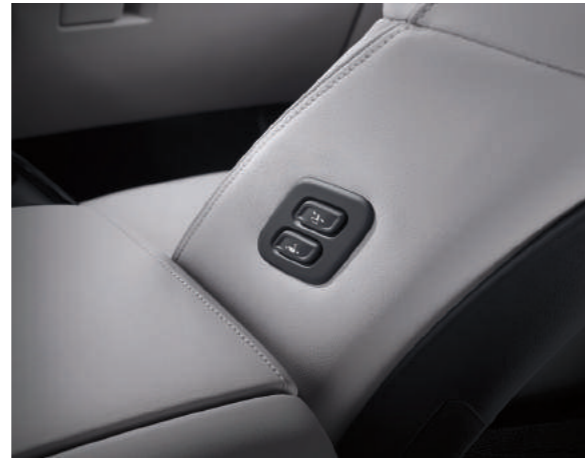
Integrated Memory Seat Walk-In-Device (Passenger)