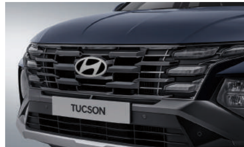
Dark Metal Paint Radiator Grille (Clear Type DRL)