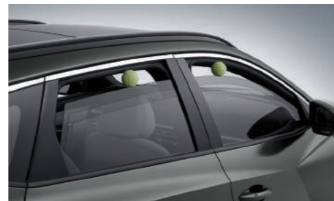
Safety Power Window