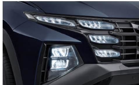
Full LED Headlamps (MFR Type)