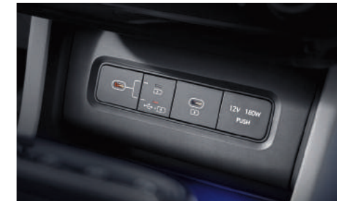
USB-C Data/Charging Ports