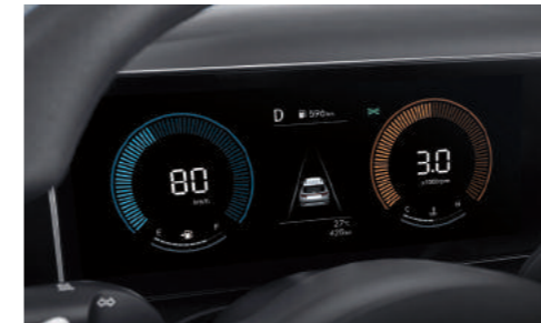
4.2-Inch Color LCD Cluster