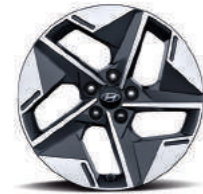
18" alloy wheels (Optional)