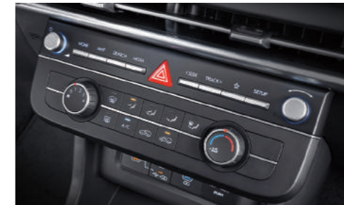
Manual Air Conditioning