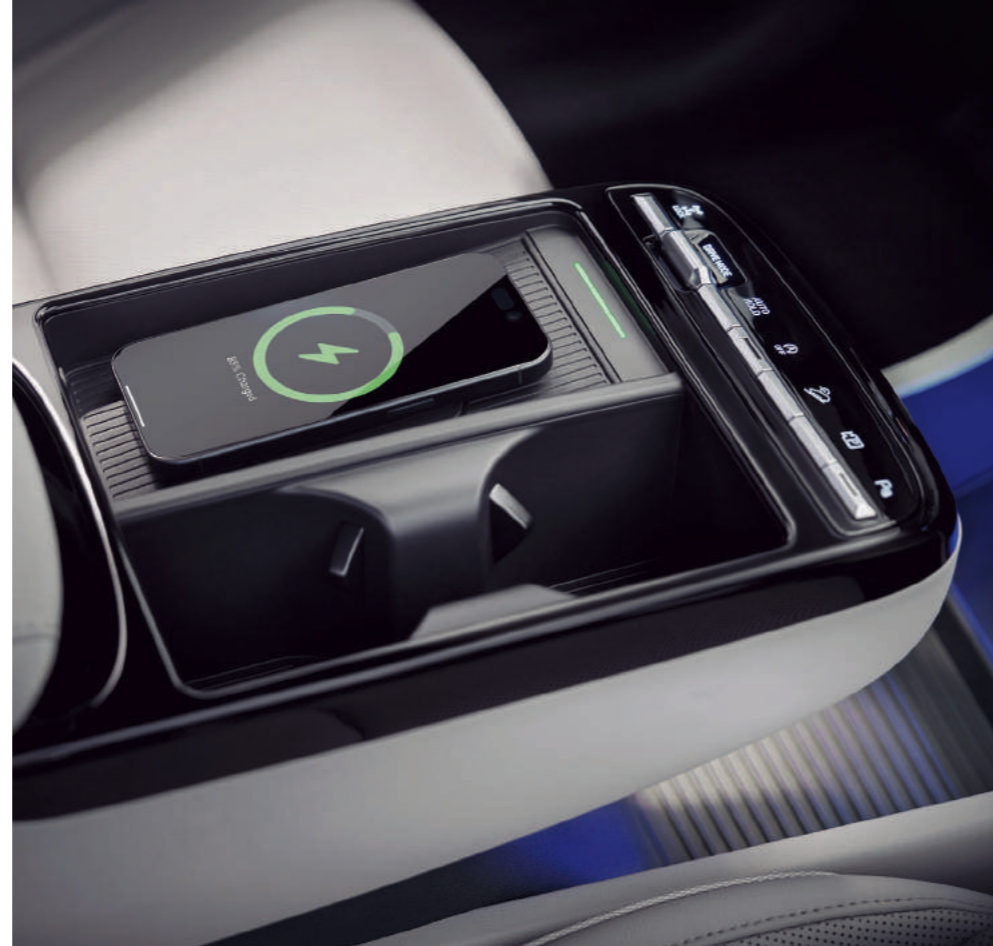
Wireless Power Charger (WPC)