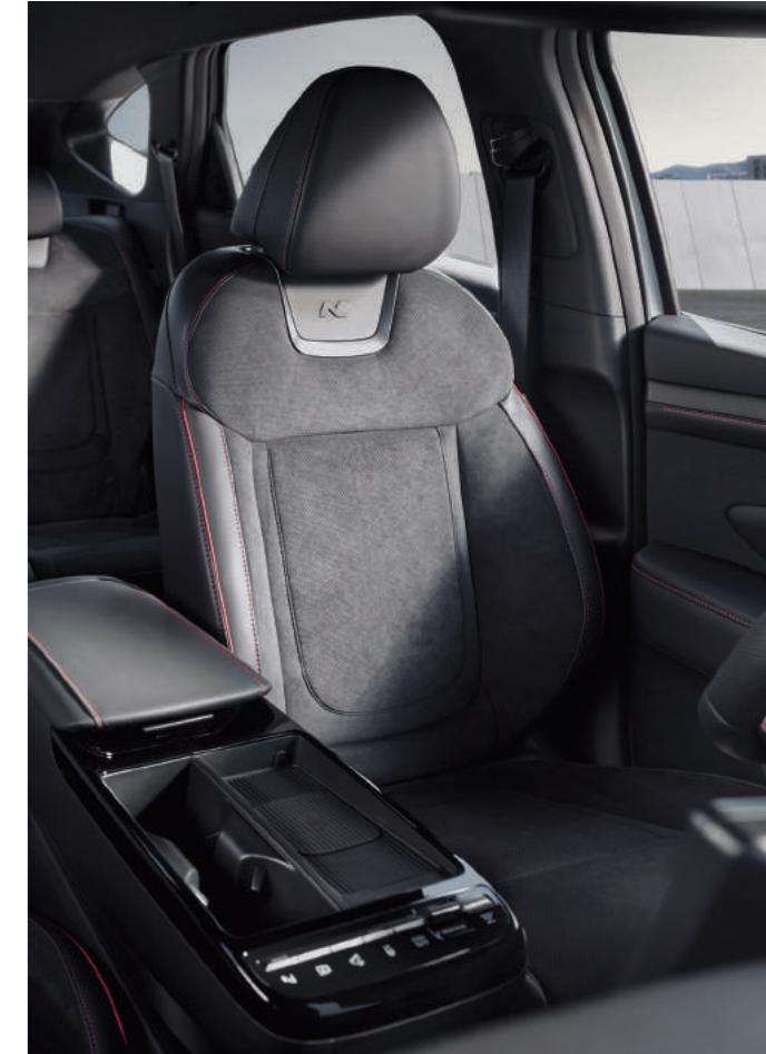
N Line-Exclusive Suede Seats