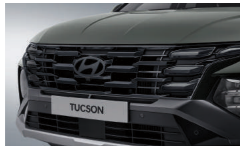
Dark Tinted Chrome Radiator Grille (Hidden Lighting DRL)