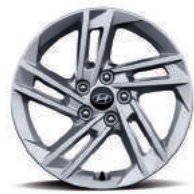
17" alloy wheels (Standard)