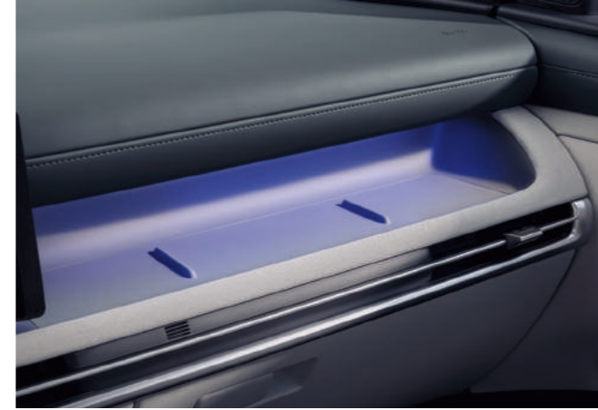
Ambient Mood Lamp / Multi-tray Floating-type Console