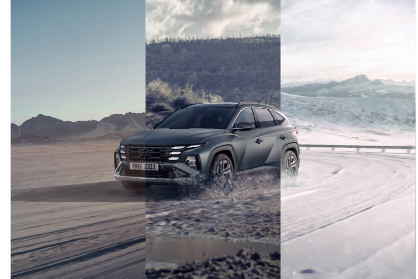
4WD HTRAC / Terrain Mode (Sand, Mud, Snow)

TUCSON AWD provides optimal driving performance through actively distributing driving force to the front and rear wheels according to various driving situations.