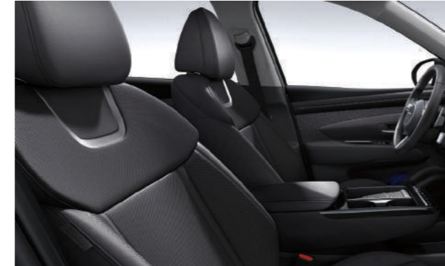
Black monotone leather