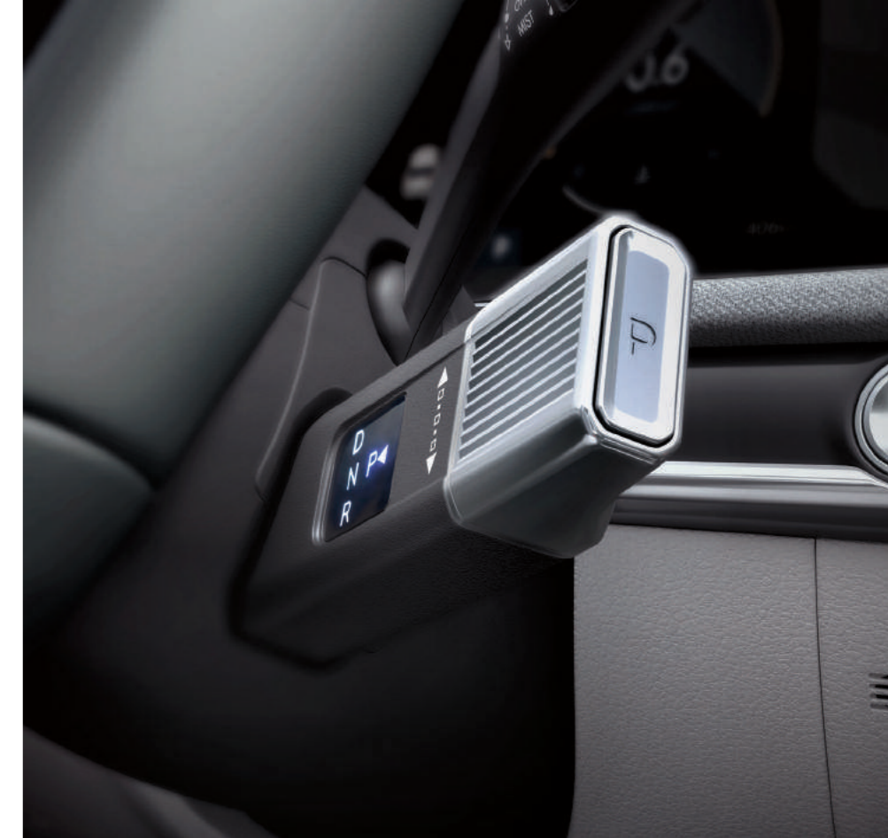
Column-type Shift by Wire (SBW)