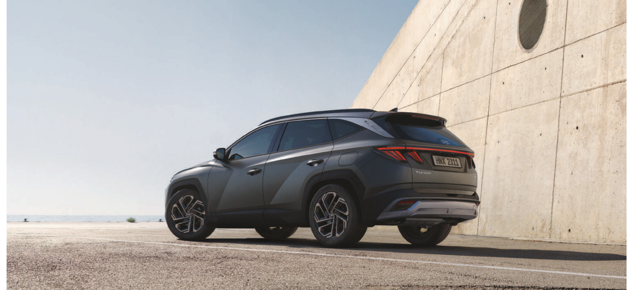
LED Rear Combination Lamps / Rear Bumper / Parametric Jewel Surfaces