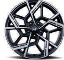
19" alloy wheels (N-Line)