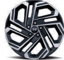
19" alloy wheels (Optional)