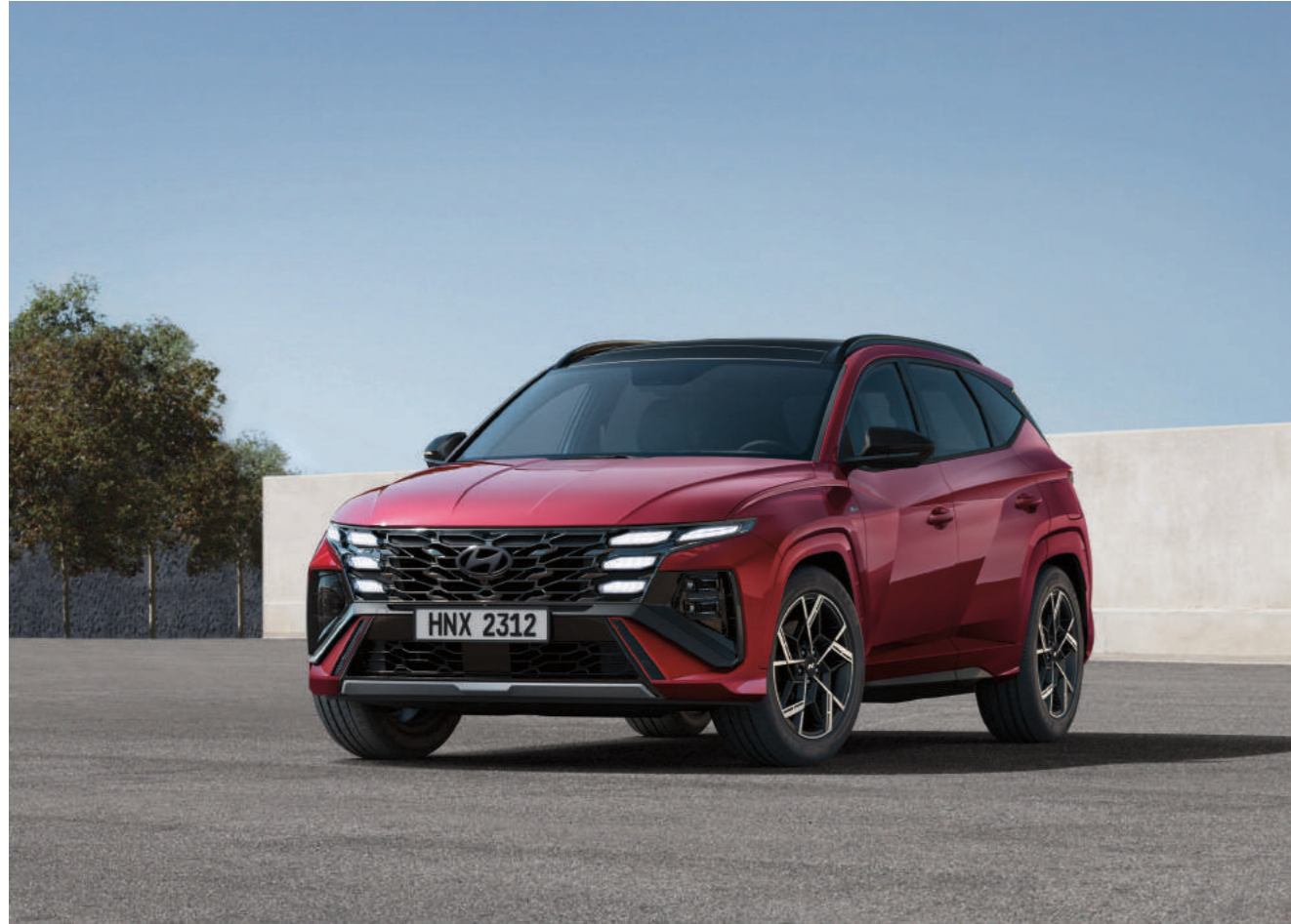
N Line Exclusive Radiator Grille

Packaged with an exclusive design, the new TUCSON N Line awaits those who desire that extra touch of sportiness.