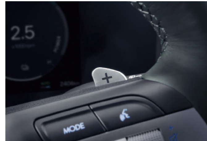
Hybrid Exclusive Features Paddle Shifter-Regenerative Braking Mode