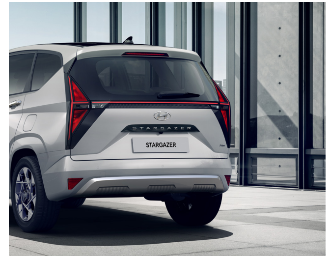
H-shape LED Rear Combination Lamp