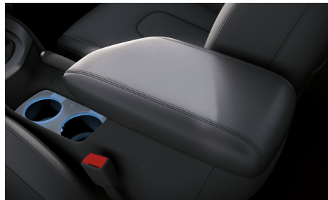
Center Console Armrest