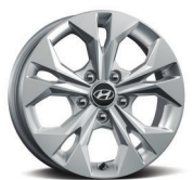
16" Alloy Wheels (Trend)