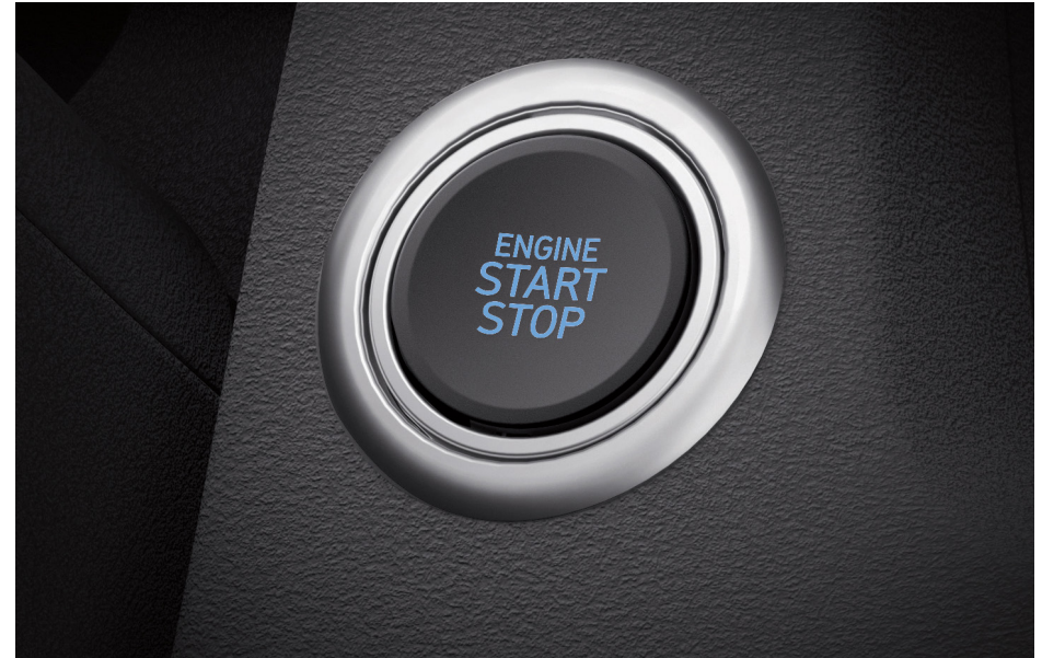
Push Button Start