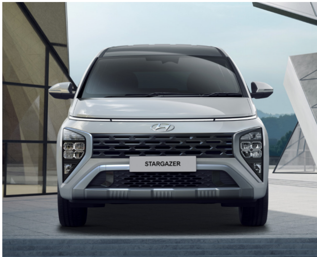
Horizon type DRL (Daytime Running Light) / Positioning Light