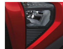
Headlamp (Active & Trend)