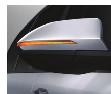
Outside Rear View Mirror with Turn Signal