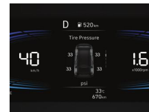
Tire Pressure Monitoring System (Style & Prime)