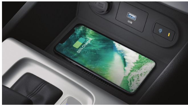
Wireless Smartphone Charger