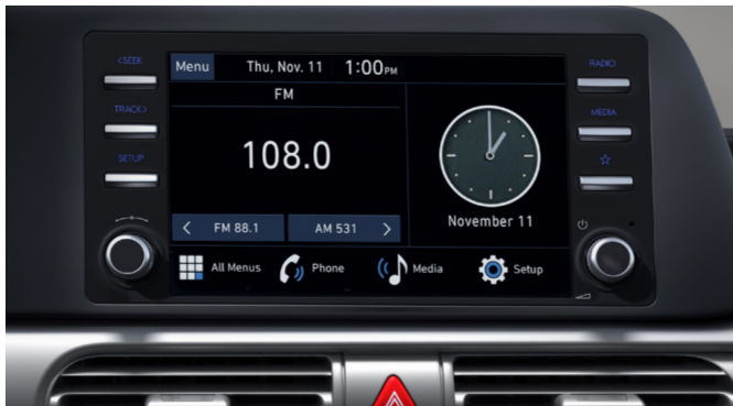
8" Display Audio with Smartphone Connectivity