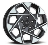
16" Sporty Alloy Wheels (Prime & Style)