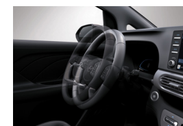
Tilt & Telescopic Steering Wheel (Trend, Style, Prime)