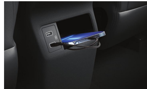
Center Console Rear Storage with USB Port