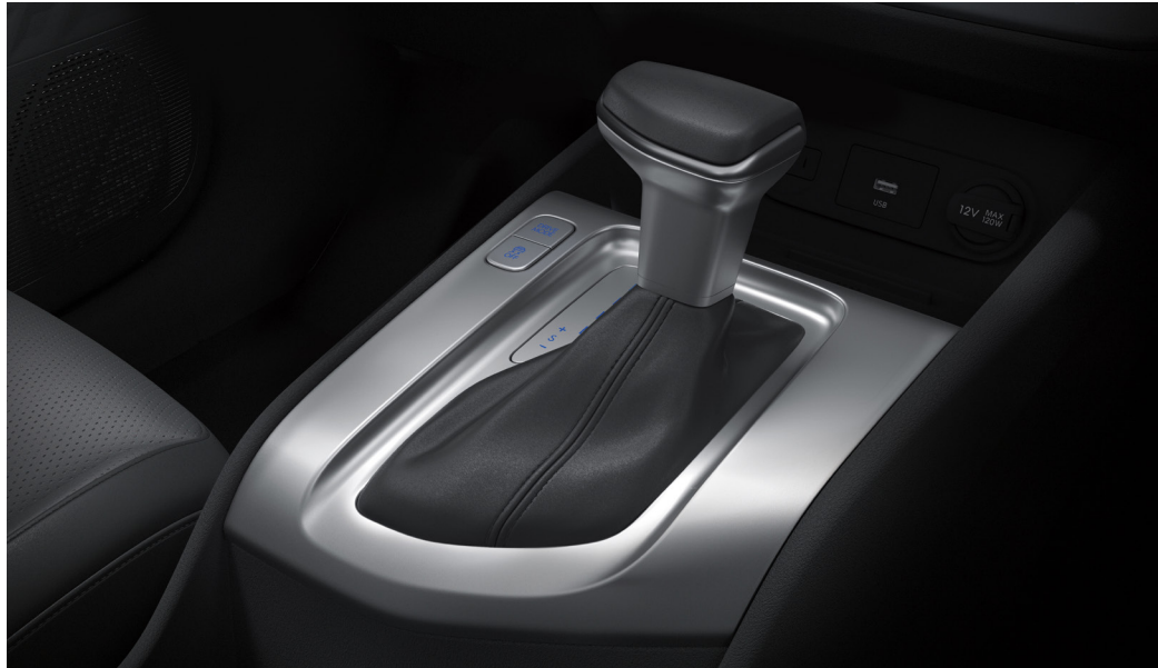
Intelligent Variable Transmission (IVT)

Hyundai STARGAZER is equipped with a 1.5L Smartstream engine with an Intelligent Variable Transmission (IVT) system that produces a tough, responsive, and efficient performance. In addition, the Drive Mode feature is also available for you to choose the most suitable driving style.