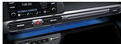
Ambient Mood Lamp (Prime)