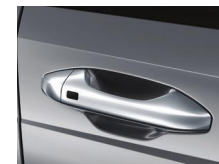
Smart Key Button - Front Door (Style & Prime)