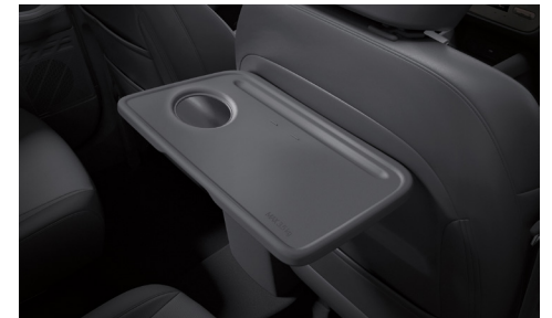
Seat Back Table