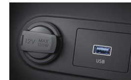
12V Power Outlet + USB Multimedia Port