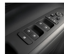
Window Control Panel with Electric Folding Outside Mirror (Style & Prime)