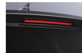
High Mount Stop Lamp