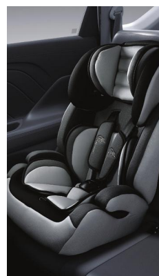
ISOFIX (Child Seat display is for illustration only)