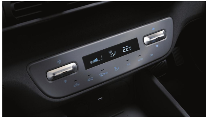
Full Automatic Temperature Control