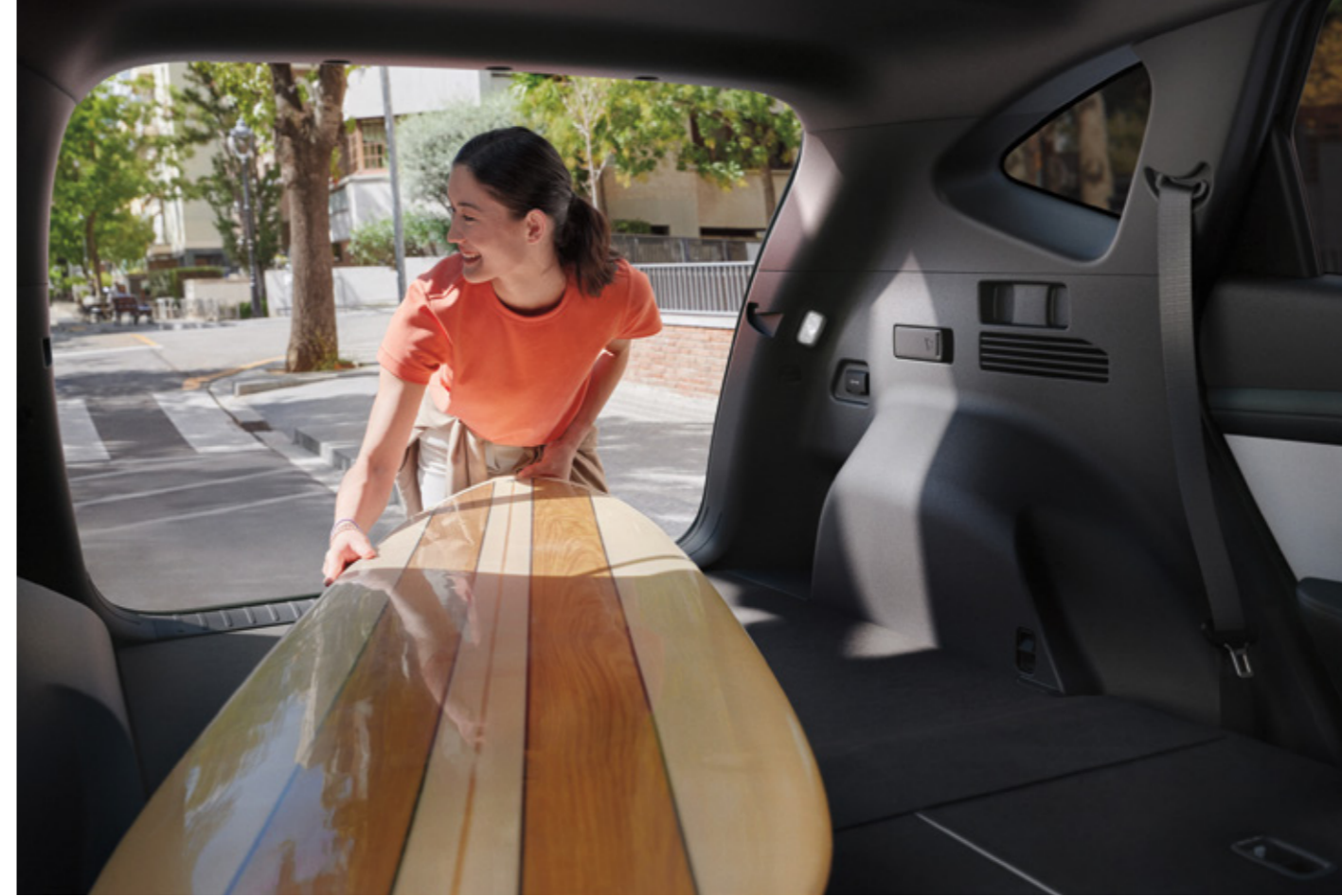
Folding Seats / Remote Folding System