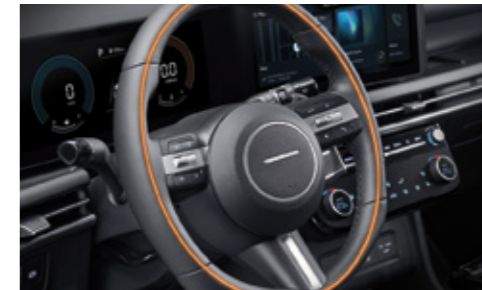
Heated Steering Wheel