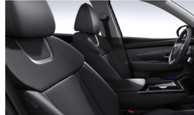
Black monotone leather