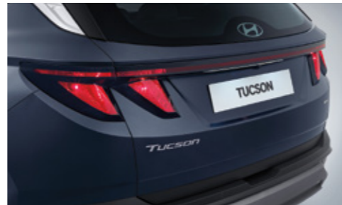
Rear Combination Lamps (Bulb Type)