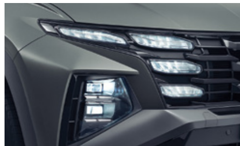
Full LED Headlamps (Wide Projection with IFS Function)