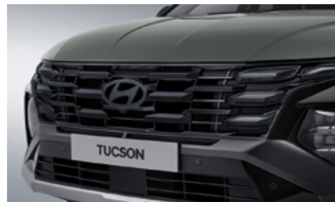
Dark Tinted Chrome Radiator Grille (Hidden Lighting DRL)