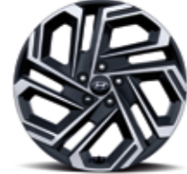
19" alloy wheels (Optional)