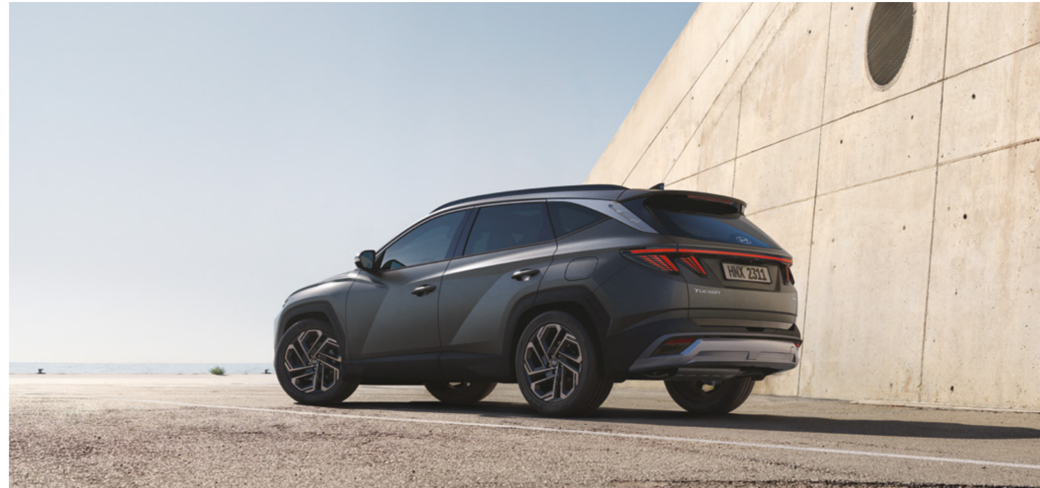
LED Rear Combination Lamps / Rear Bumper / Parametric Jewel Surfaces