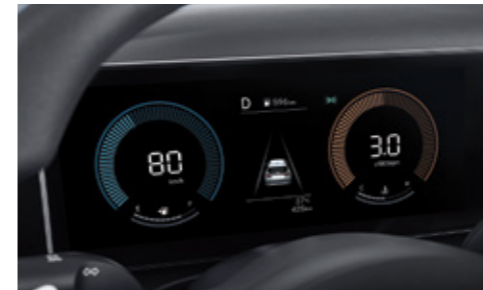
4.2-Inch Color LCD Cluster