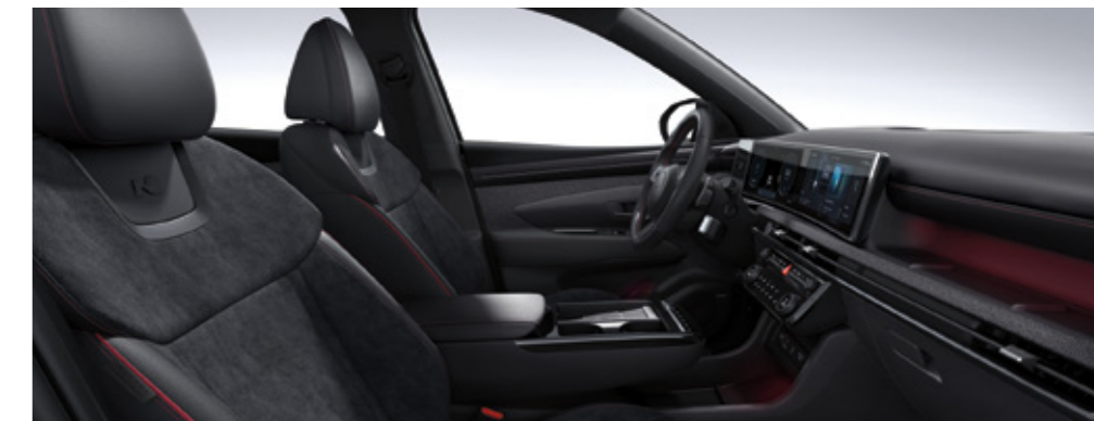
Black monotone suede + leather with red stitching