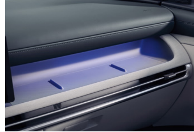
Ambient Mood Lamp / Multi-tray Floating-type Console