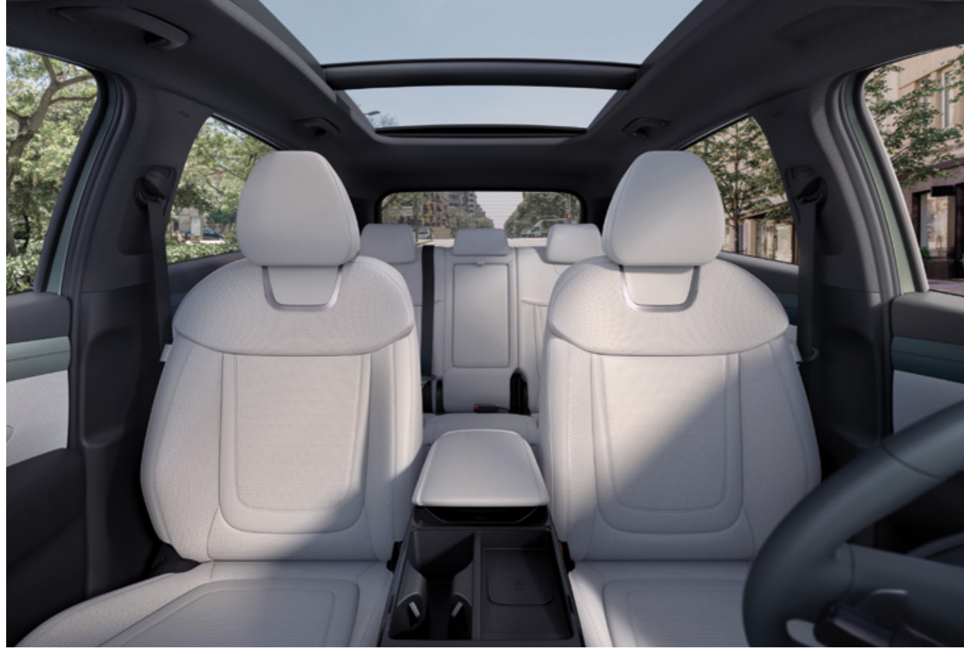
1st & 2nd Row Seat

Make room for more. Its best-in-class cargo space and roomy interior support various lifestyles and activities, offering more versatility than ever.