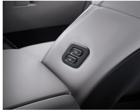
Integrated Memory Seat Walk-In-Device (Passenger)