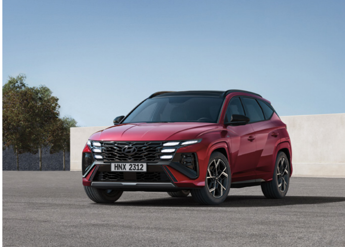
N Line Exclusive Radiator Grille

Packaged with an exclusive design, the new TUCSON N Line awaits those who desire that extra touch of sportiness.