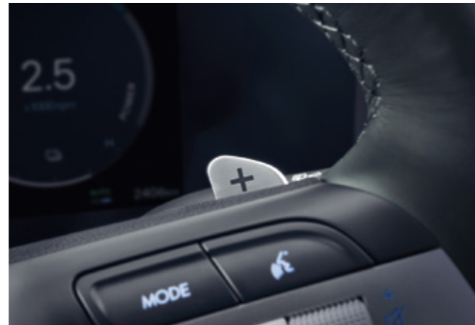
Hybrid Exclusive Features Paddle Shifter-Regenerative Braking Mode