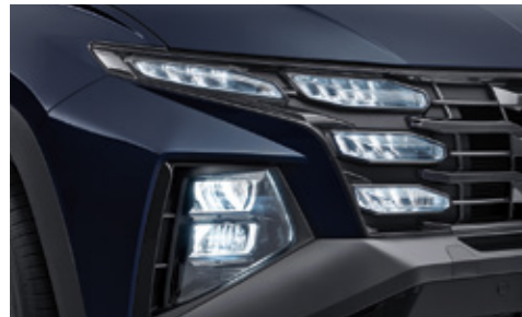
Full LED Headlamps (MFR Type)