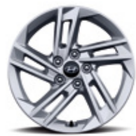
17" alloy wheels (Standard)