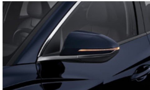
Turn Signal Indicator LED Outside Mirror