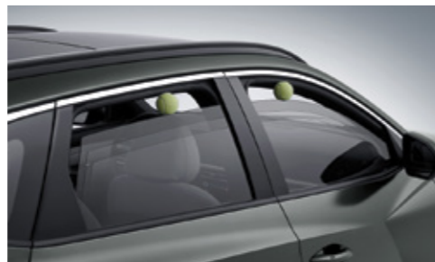
Safety Power Window