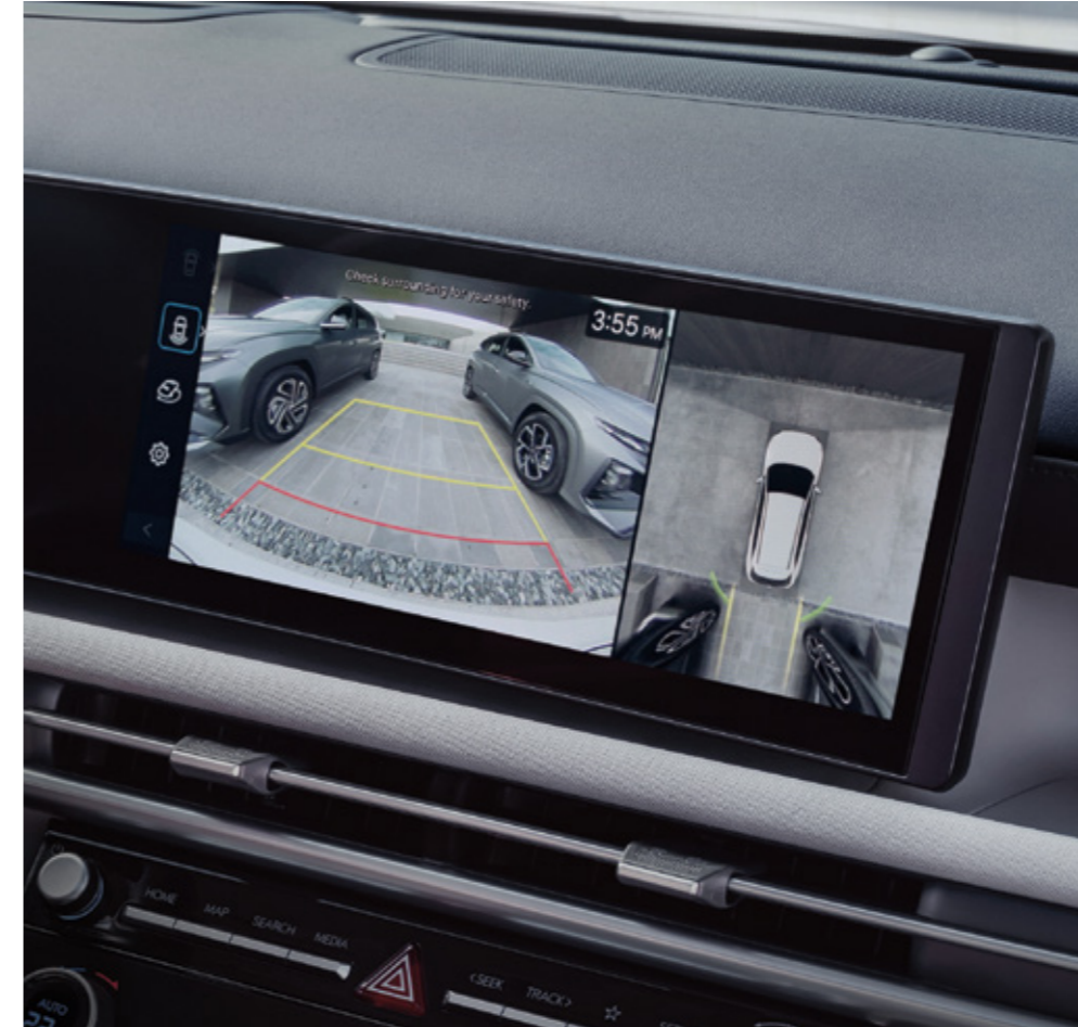
Surround View Monitor (SVM)