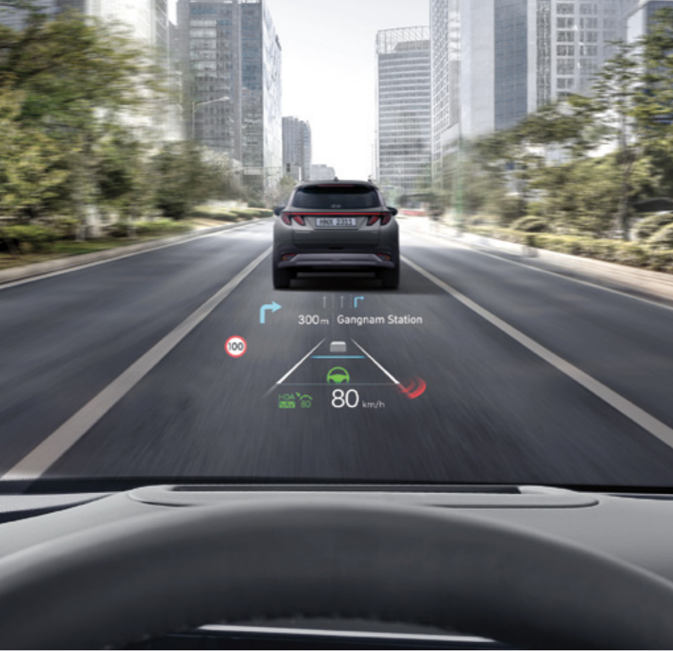
12-inch Head-up Display (HUD)