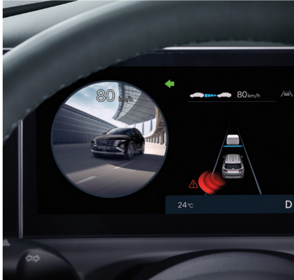
Blind-Spot View Monitor (BVM)

The new TUCSON is packed with reliable features to protect you from the unexpected and ensure you leave no one behind.