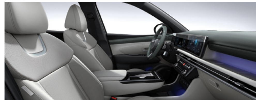
Green three-tone leather