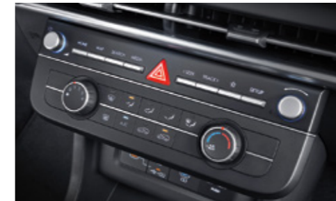
Manual Air Conditioning