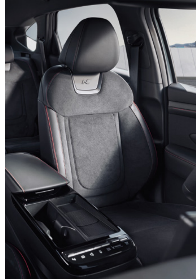
N Line-Exclusive Suede Seats