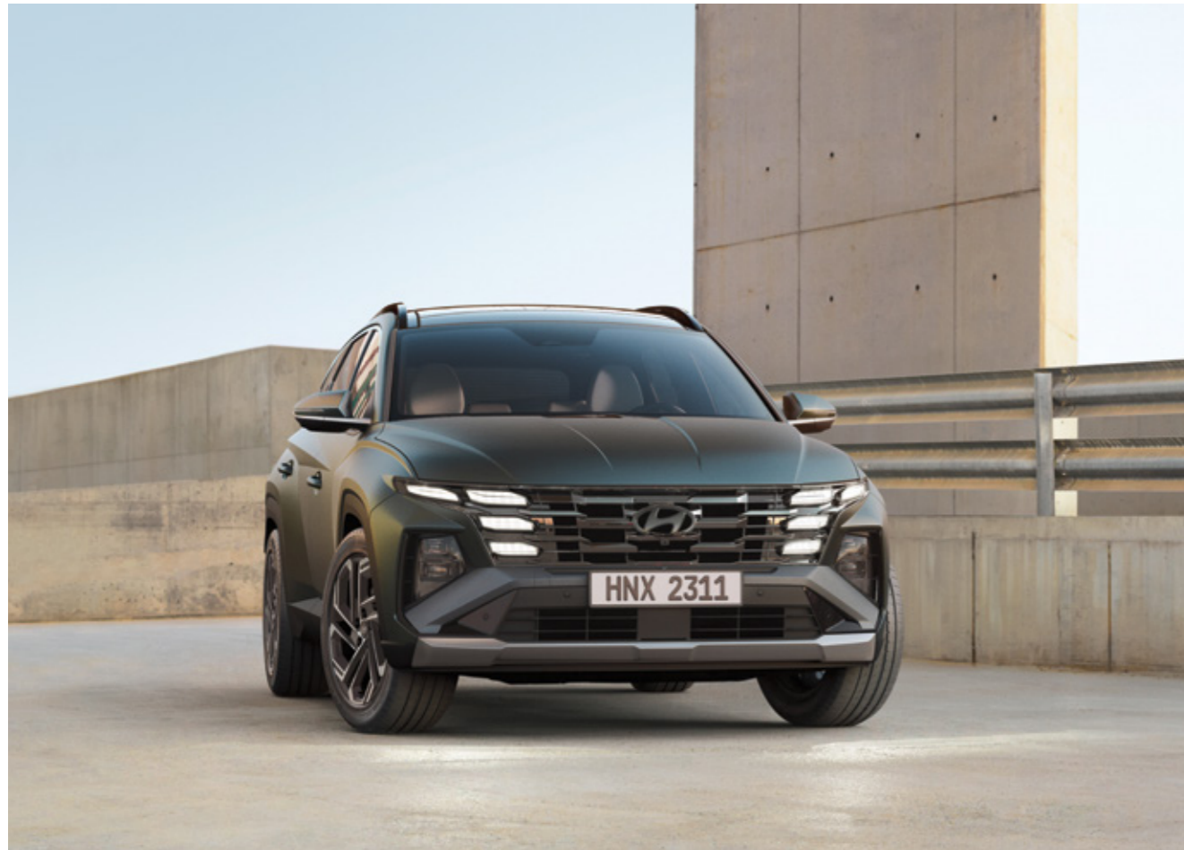
Parametric Jewel Hidden Signature Lamps / Radiator Grille / Front Bumper

Reject the ordinary with eye-catching jewel-like elements of the front lamps as well as around the sides - boldly upgraded to allow you to stand out from the crowd.