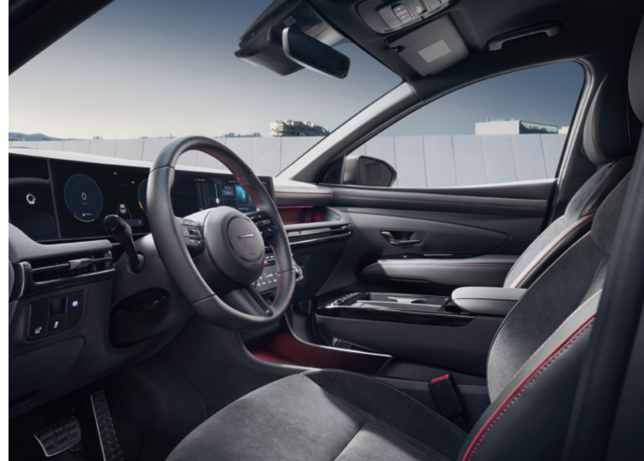
N Line-Exclusive Interior (N Line Emblem Steering Wheel / Red Stitching)