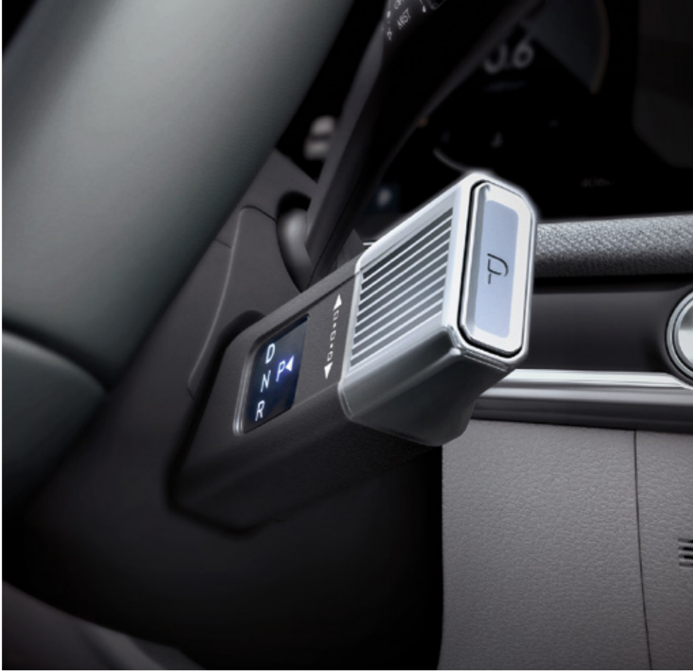
Column-type Shift by Wire (SBW)