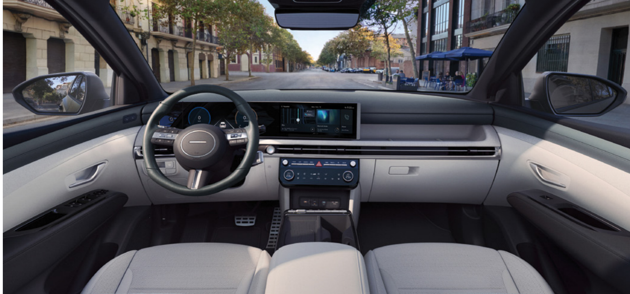
Wrap-Around Architecture Design

The cabin's wide horizontal design wraps around the interior, enveloping the passengers with a seamless architecture that integrates technology and style.