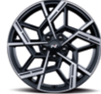
19" alloy wheels (N-Line)