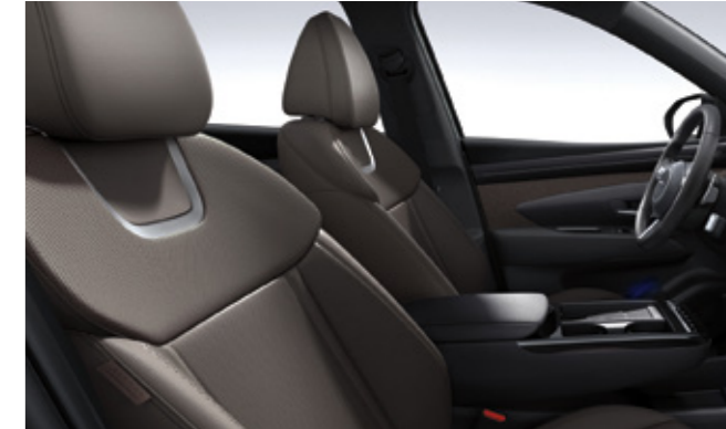
Brown color package leather