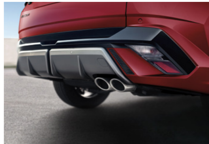
N Line-Exclusive 19-inch Alloy Wheels / Body-color Cladding N Line-Exclusive Single Twin Tip Muffler