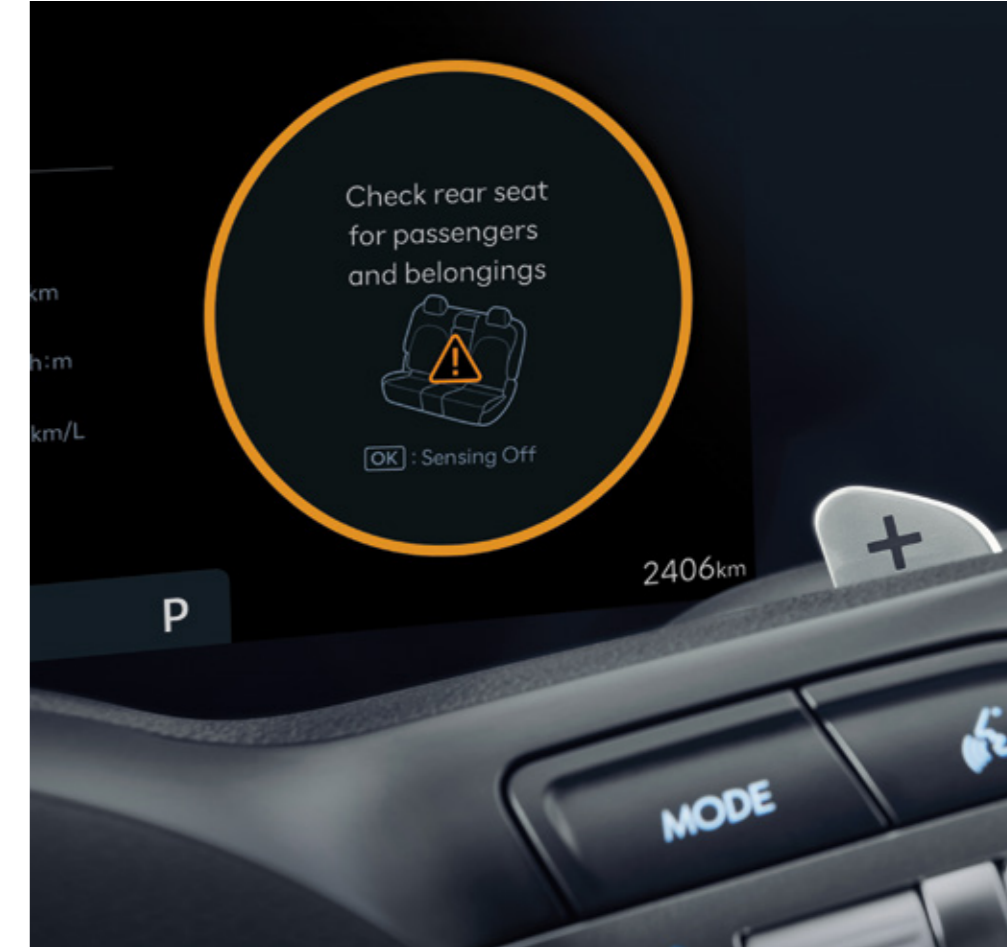
Rear Occupant Alert (ROA)