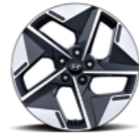
18" alloy wheels (Optional)