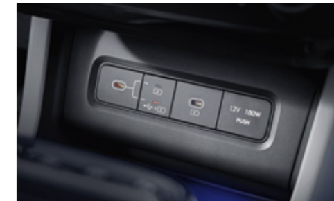
USB-C Data/Charging Ports