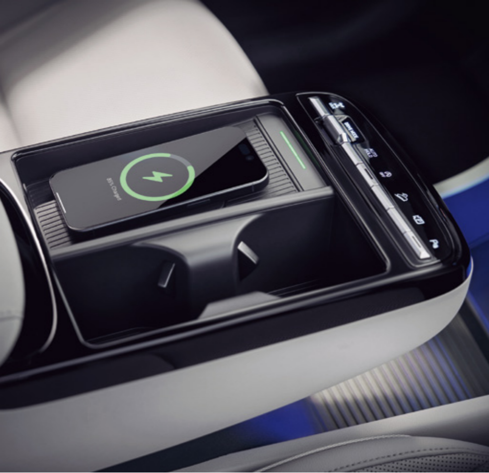
Wireless Power Charger (WPC)