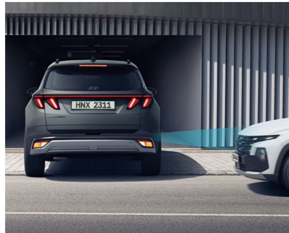
Parking Collision Avoidance Assist (PCA) Reverse Parking Collision Avoidance Assist (PCA) provides a warning if there is a risk of collision with a rear object while reversing. After the warning, if the risk of collision increases, it automatically assists with emergency braking.