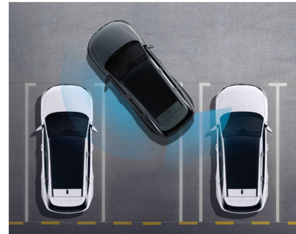
Forward/Side/Reverse Parking Distance Warning (PDW) Forward/Side/Reverse Parking Distance Warning (PDW) warns against collisions with objects around the vehicle at low speeds.