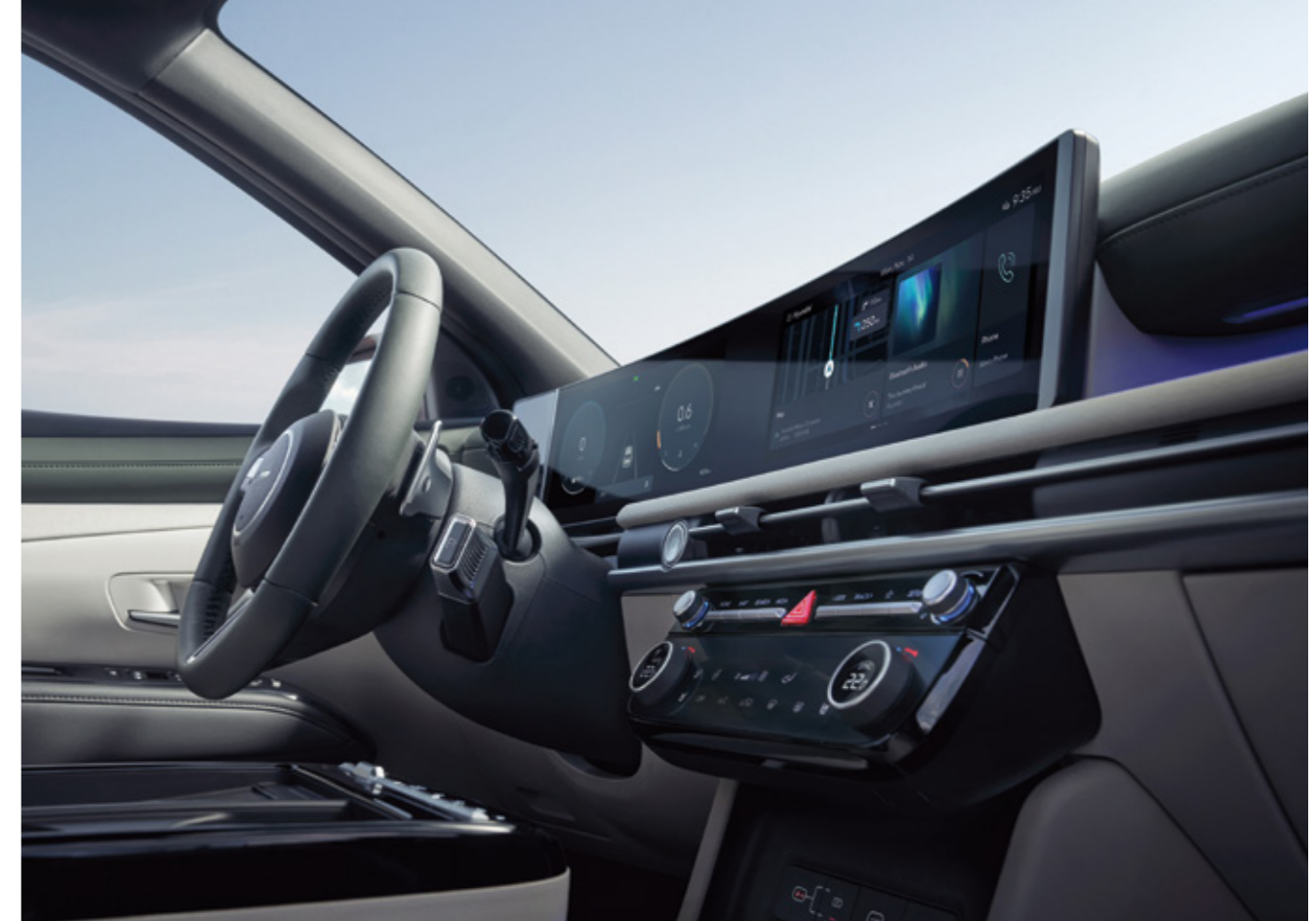
Panoramic Curved Display 12.3-inch (Cluster) + 12.3-inch (AVNT)