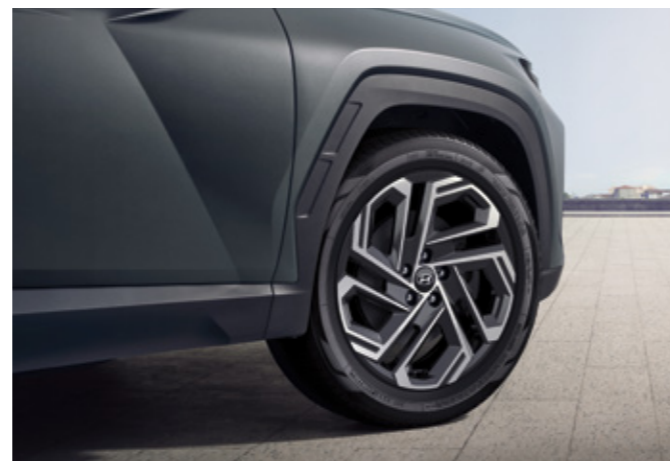
Roof Rail / Panoramic Sunroof 19-inch Alloy Wheels