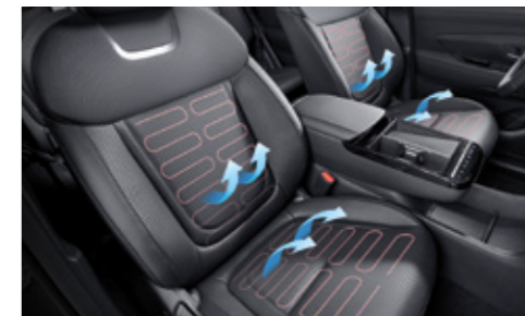
Front Heated and Ventilated Seats