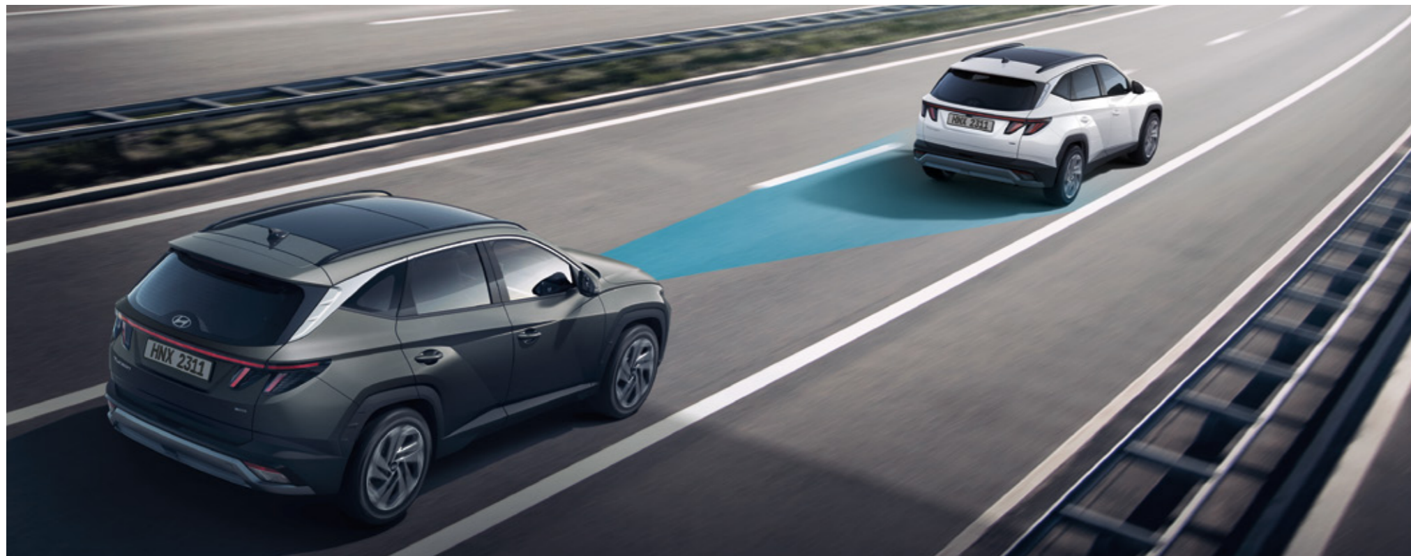
Smart Cruise Control (SCC) Smart Cruise Control (SCC) helps maintain distance from the front vehicle and drive at a speed set by the driver. Automatically stops when the front vehicle stops and automatically starts when the front vehicle departs within a short time.