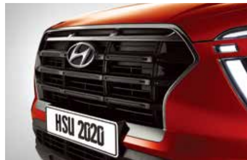
Dark chrome grille (Turbo Only)