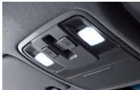
LED personal lamps (Panoramic sunroof only)