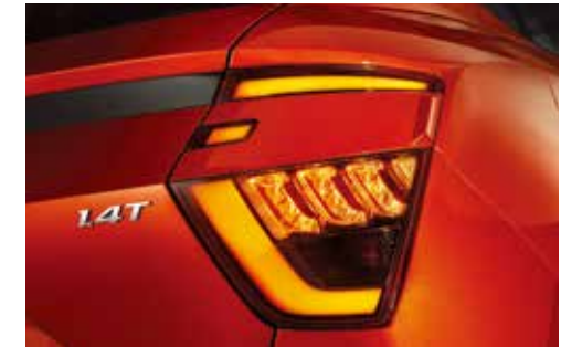
LED rear combination lamps