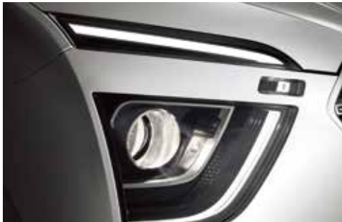
Halogen projection headlamps