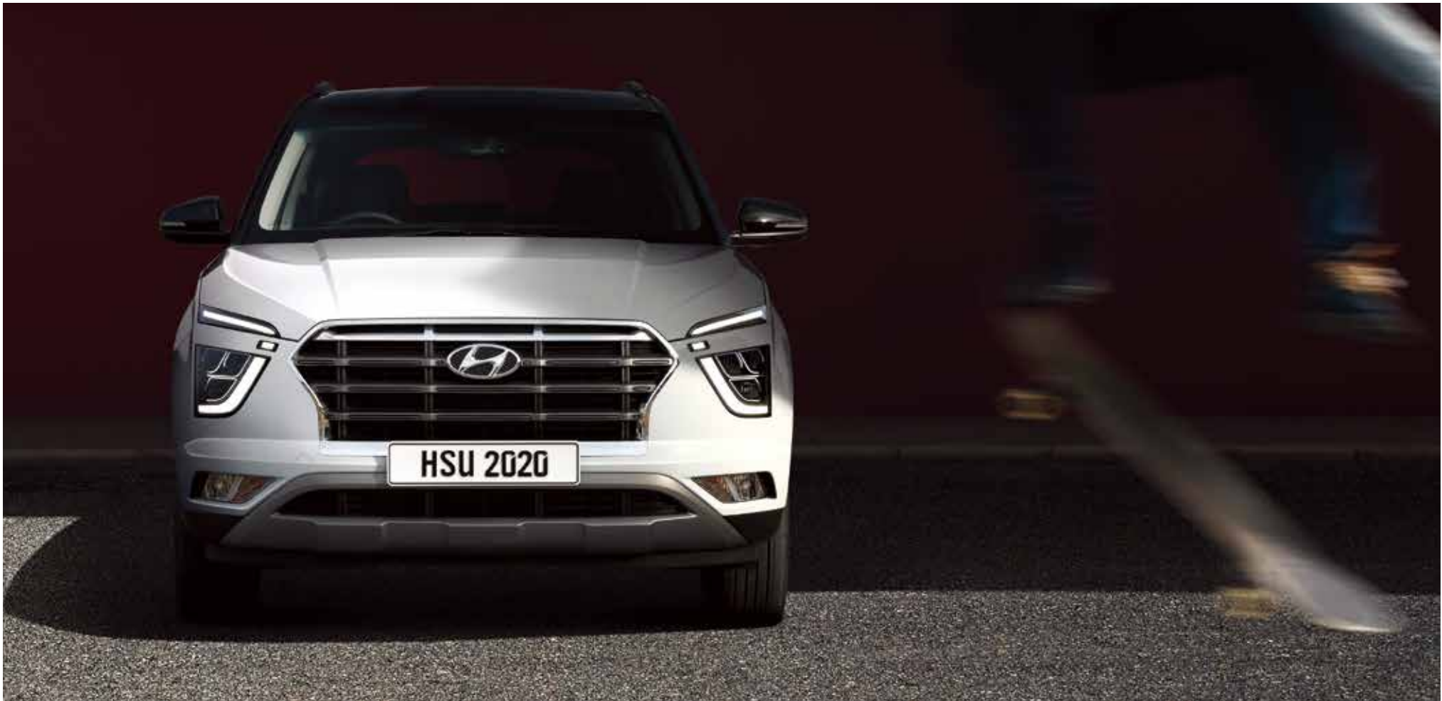
Aero-sculpted front end with signature cascading grille