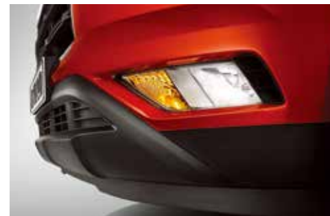
Front fog lamps (MFR)