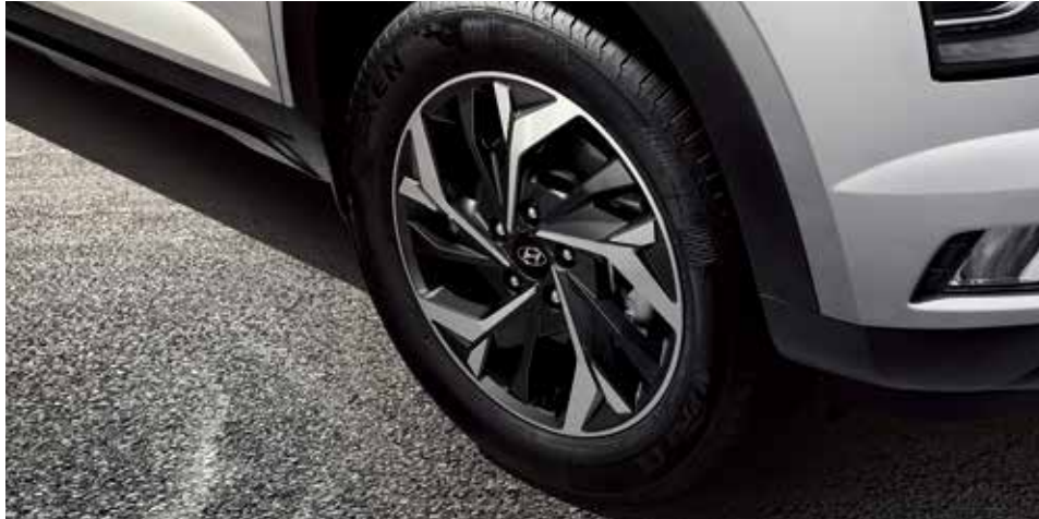
LED headlamps with LED DRLs 17" diamond-cut alloy wheels