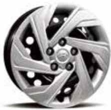
16" steel covers