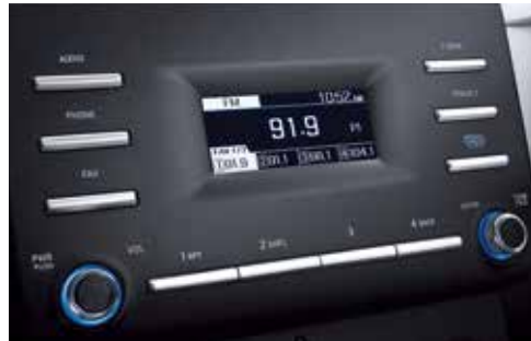
Standard audio with 3.8" LCD