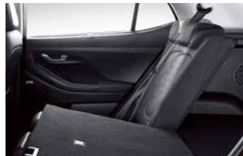
6:4-split rear seats with 2-stage recliner