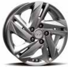
16" alloy wheels