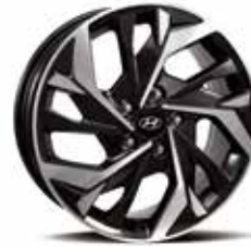
17" alloy wheels (C Type)