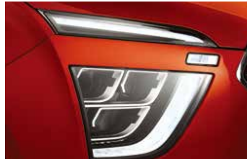
LED MFR headlamps & LED DRLs