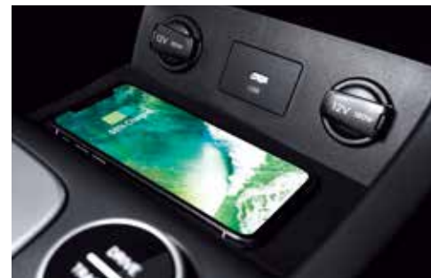
Wireless smartphone charging system