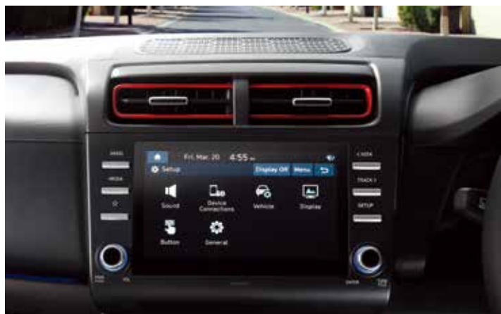
8" display audio

Goodbye analog, hello digital: The optional 7" Supervision instrument cluster displays richly detailed information with razor-sharp clarity and in vivid colors. The optional 8" display audio comes with Apple CarPlay™ and Android Auto™ support and voice command capability. With Bluetooth pairing it mirrors your smartphone's navigation app and will also let you stream audio.