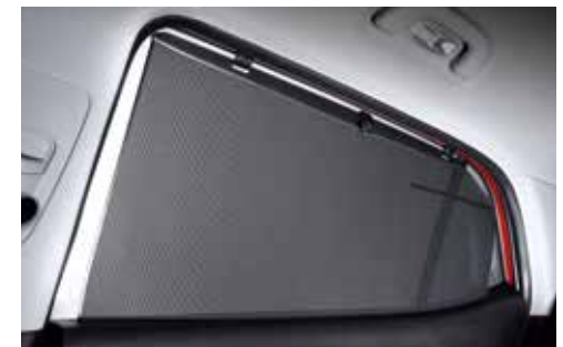
Manual rear door curtain

* Features and specifications vary by market. Please consult your local dealer.