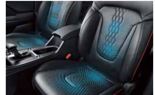
Ventilated front seats