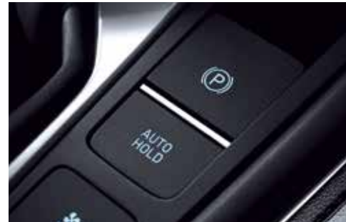
Electric Parking Brake with Auto Hold