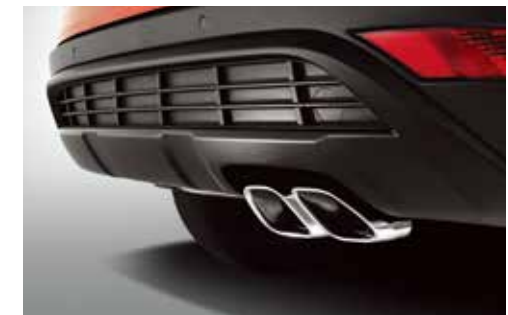
Twin-tip exhaust (Turbo only)