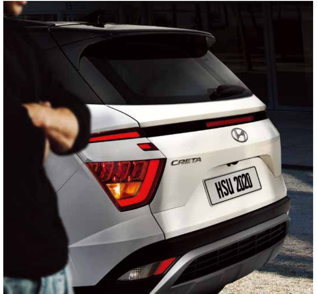
LED rear combination lamps