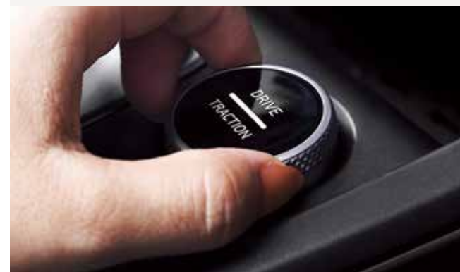
Traction Control Mode