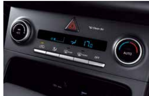
Full automatic temperature controls