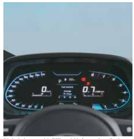
Digital cluster with TFT multi information display