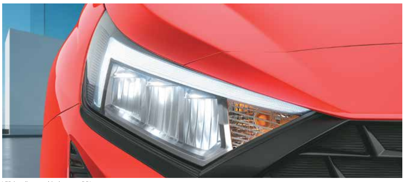
LED headlamps with signature DRLs