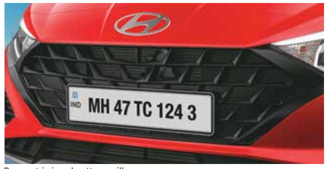
Parametric jewel pattern grille