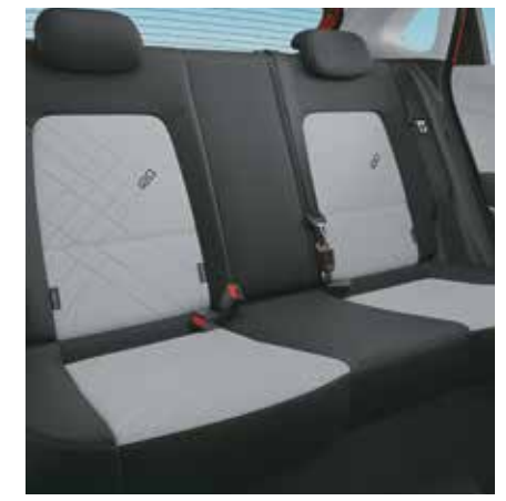
Spacious interiors with ample headroom, legroom and shoulder room