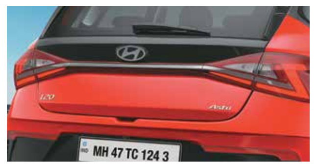
Stylish Z-shaped LED tail lamps