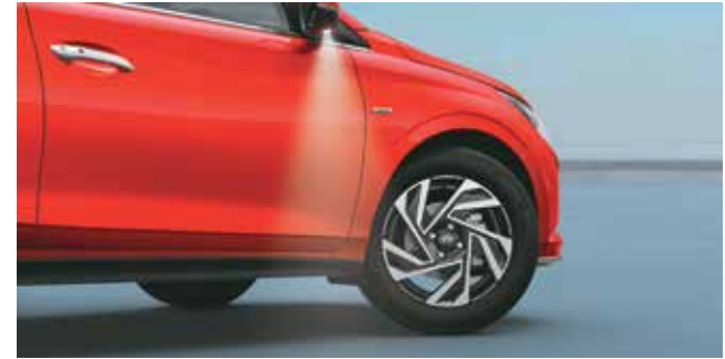
Puddle lamps with welcome function

Other features: Chrome outside door handles | Turn indicators on outside mirrors Painted black finish side sill garnish with i20 branding | Shark fin antenna