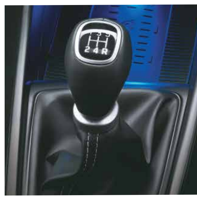
5 speed manual transmission