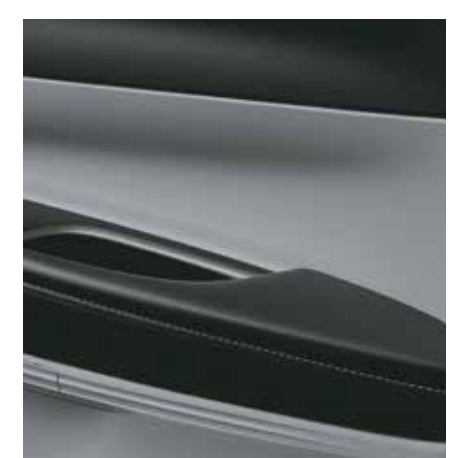
Door armrest covering (artificial leather)