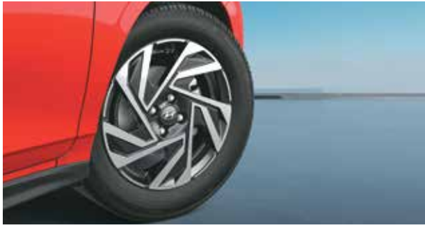
R16 (D=405.6 mm) diamond cut alloy wheels