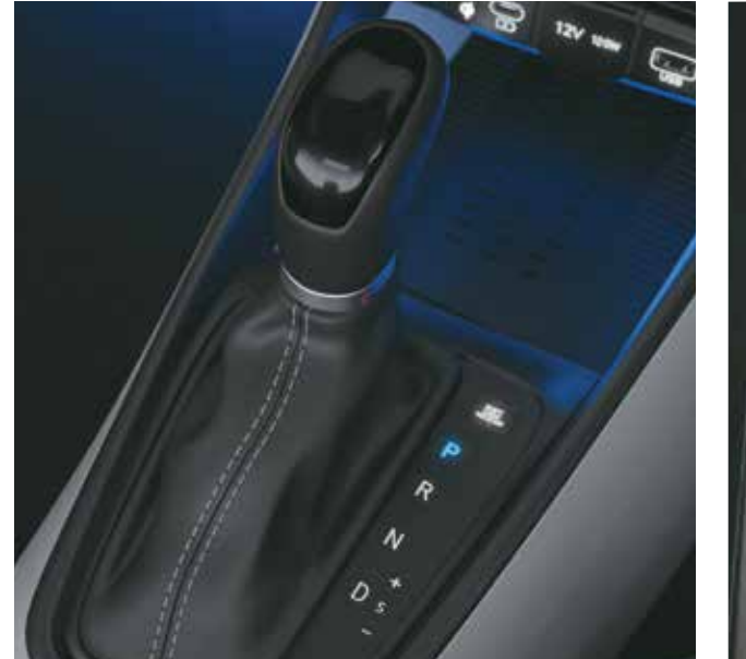
Intelligent variable transmission (IVT)