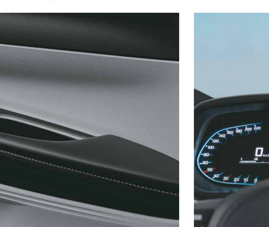
Digital cluster with TFT multi information display Door armrest covering (artificial leather)

Other features: Superior leg room and thigh support | Sliding front armrest | Leather wrapped steering wheel and gear knob | Metal finish inside door handles