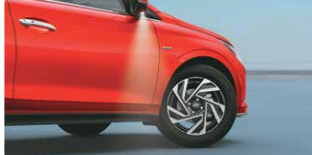
Puddle lamps with welcome function

Other features: Chrome outside door handles | Turn indicators on outside mirrors Painted black finish side sill garnish with i20 branding | Shark fin antenna