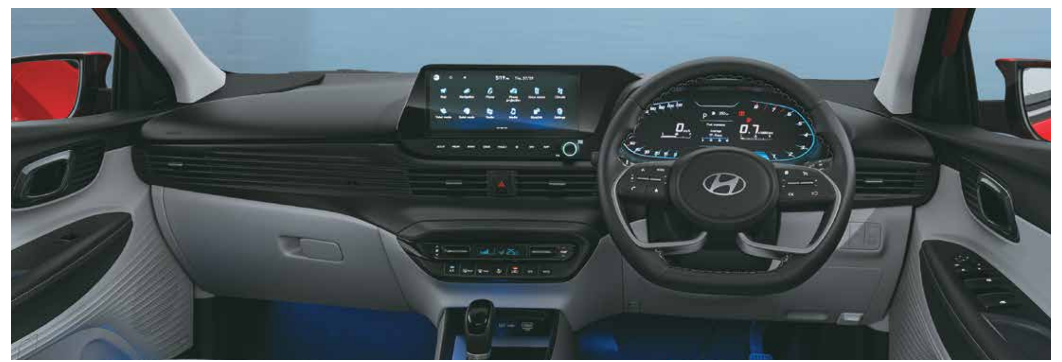
Dual tone black & grey interiors