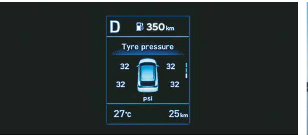
Tyre pressure monitoring system (highline) with display on MID

Hyundai i20 ensures you drive safe wherever you go. It comes equipped with advanced safety features that are a cut above the rest. 6 airbags for maximum protection. Electronic stability control (ESC) with vehicle stability management (VSM) and emergency stop signal (ESS) ensure that you always drive stress free.