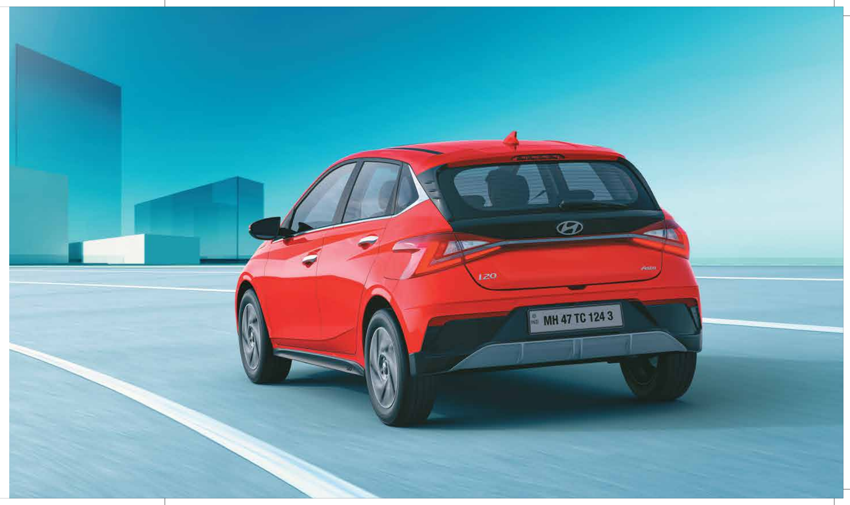
5 speed manual transmission