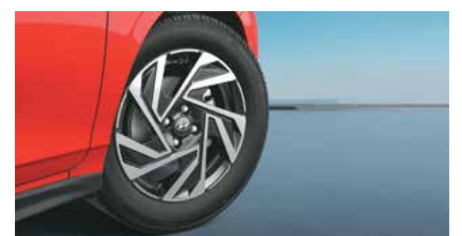
R16 (D=405.6 mm) diamond cut alloy wheels