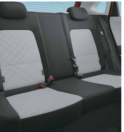
Spacious interiors with ample headroom, legroom and shoulder room