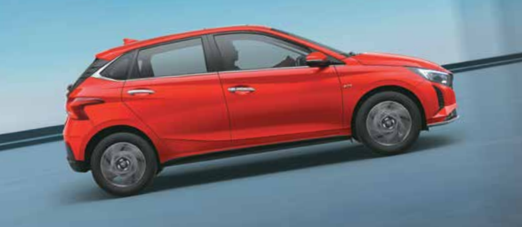
Hill-start assist control (HAC)