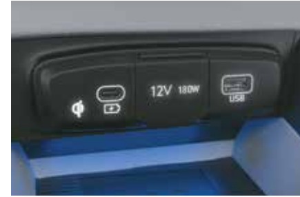
Fast USB charging (Type C)