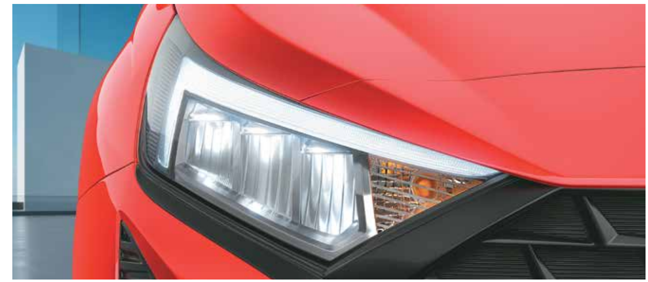
LED headlamps with signature DRLs