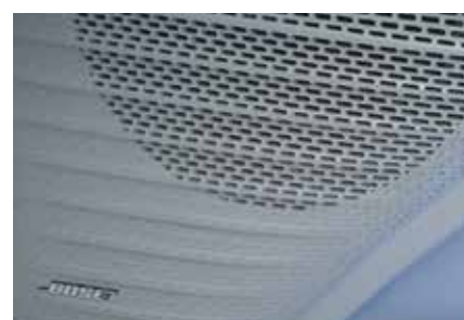
Bose premium 7 speaker system

Other features: 60+ Bluelink connected features | Multi-language UI support (12 nos.) | OTA updates for infotainment and map Home to car (H2C) with Alexa (English & Hindi) | Cruise control | Rear AC vents | Multi phone bluetooth connectivity