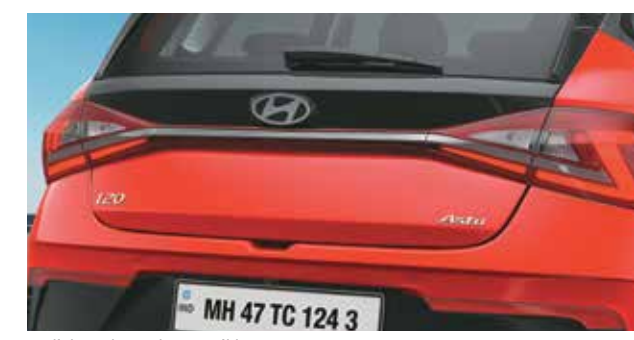
Stylish Z-shaped LED tail lamps