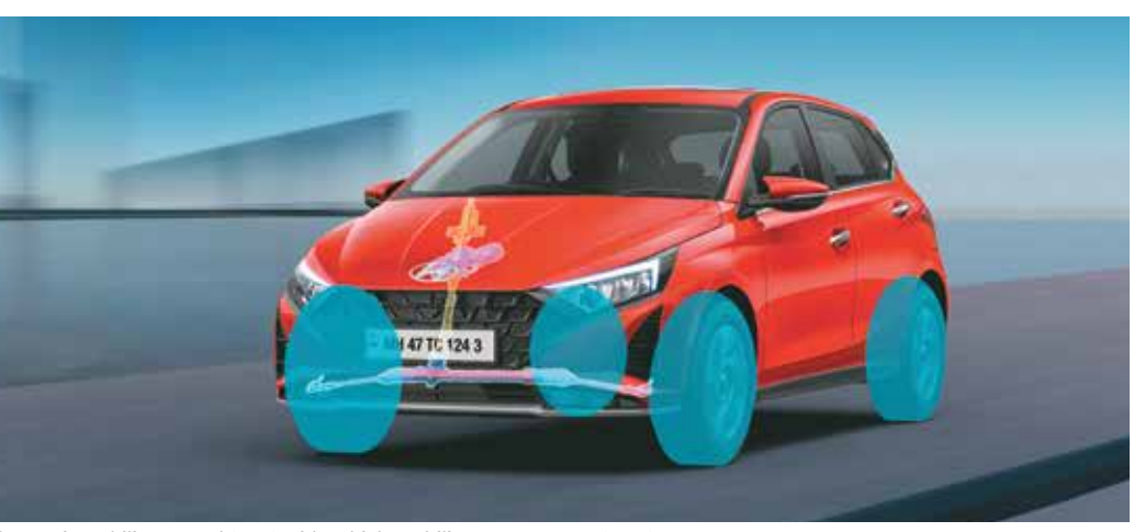
Electronic stability control (ESC) with vehicle stability management (VSM)

Other features: Impact sensing auto door unlock | Speed sensing auto door lock | Automatic headlamps | Burglar alarm | Driver rear view monitor (DRVM) | Emergency stop signal 3-point seat belt & seat belt reminder (all seats) | Rear camera with dynamic guidelines | ISOFIX (standard)