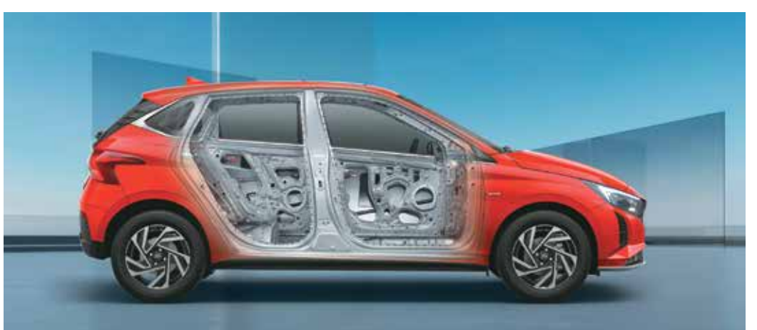
Strong body structure (with AHSS and HSS)