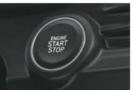
Push button start/stop