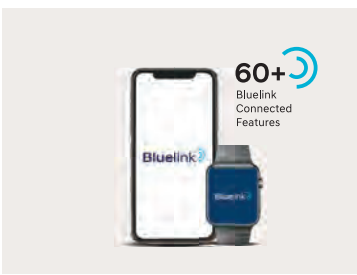
Bluelink connected car technology (Free for 3 years)