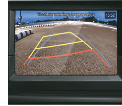
Rear view camera with dynamic guidelines