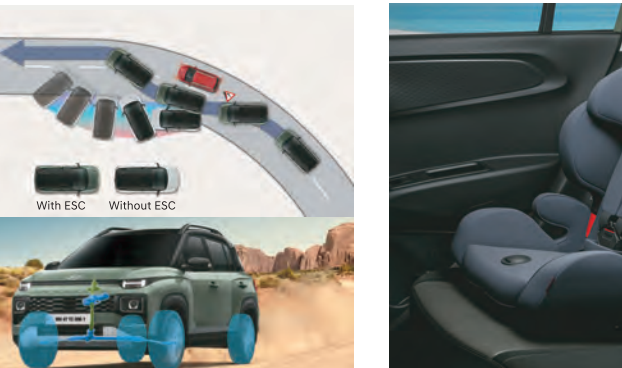
Electronic stability control (ESC) Vehicle stability management (VSM)