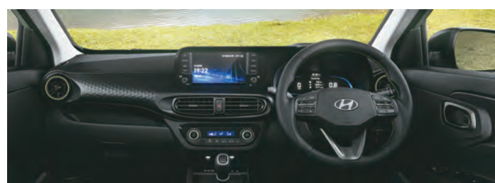
Black interiors with light sage inserts