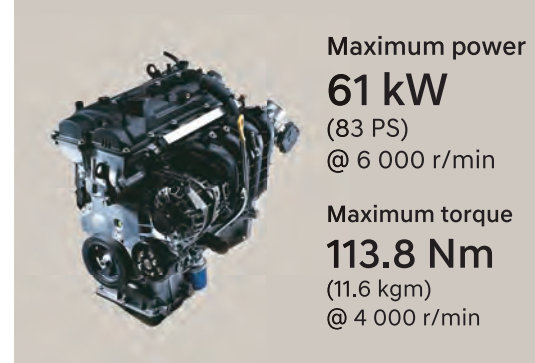
1.2 | Kappa petrol

Get set to live the SUV life with Hyundai EXTER that comes in three powertrain options, each capable of delivering a power-packed performance. So, the next time you go outside, all you need to do is hit the road in your Hyundai EXTER with confidence.