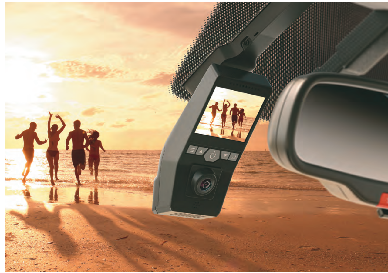
Dashcam with dual camera

Hyundai EXTER comes equipped with a host of high-tech features, so you have absolute control over your many worlds even when on the go. From on-board navigation, smartphone connectivity to infotainment with multiple regional UI language support, Hyundai EXTER has everything to ensure you never miss anything when you are exploring outside.