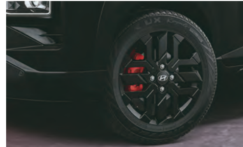
Red front brake calipers