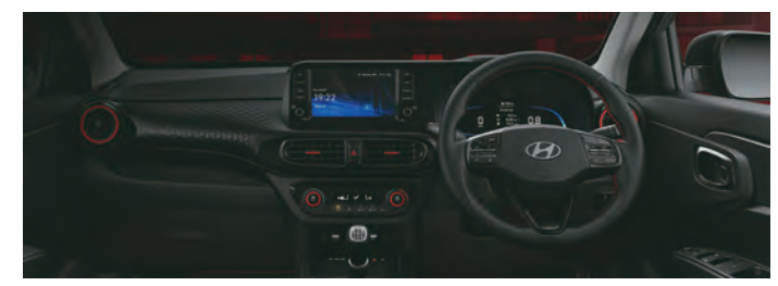
Black interiors with red accents & stitching