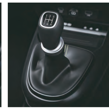
Manual transmission (MT)