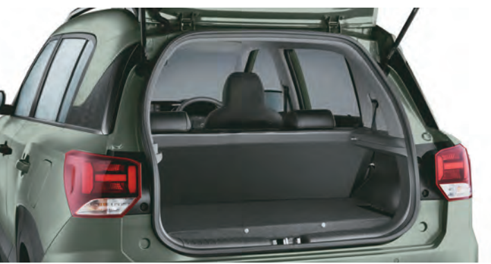
Ample hoot space

Hyundai EXTER Hy-CNG duo is engineered to optimize every journey. Equipped with a dual-cylinder system, it offers more boot space and enhanced efficiency. This SUV ensures you have all the room you need for your adventures while delivering exceptional performance.