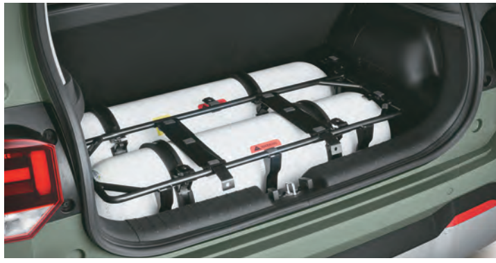
ompany fitted dual cylinder CNG