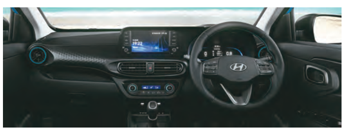
Black interiors with cosmic blue inserts