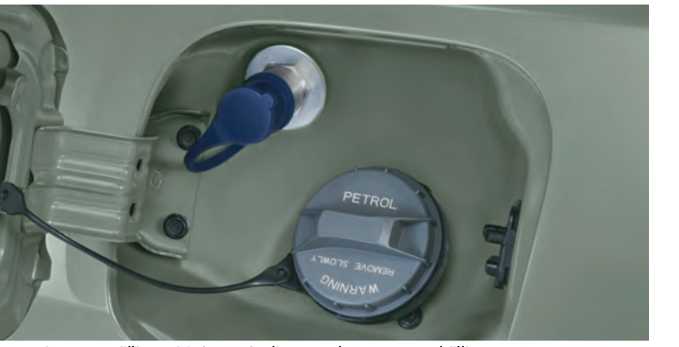
Convenient CNG filling with fast refueling nozzle (near petrol filling area)