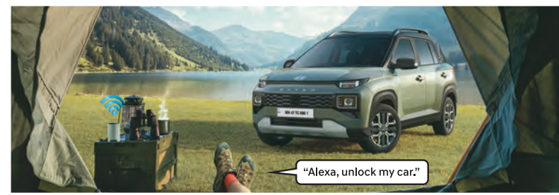
Home to car (H2C) with Alexa*** (English & Hindi)