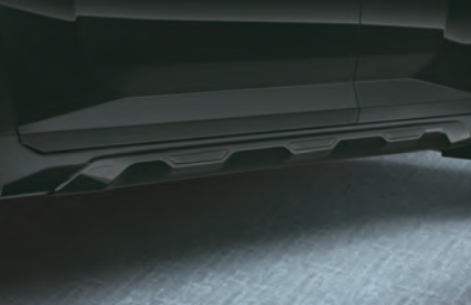
Black painted side sill garnish