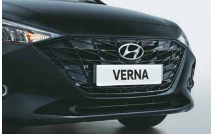
Glossy black front radiator grille (turbo)