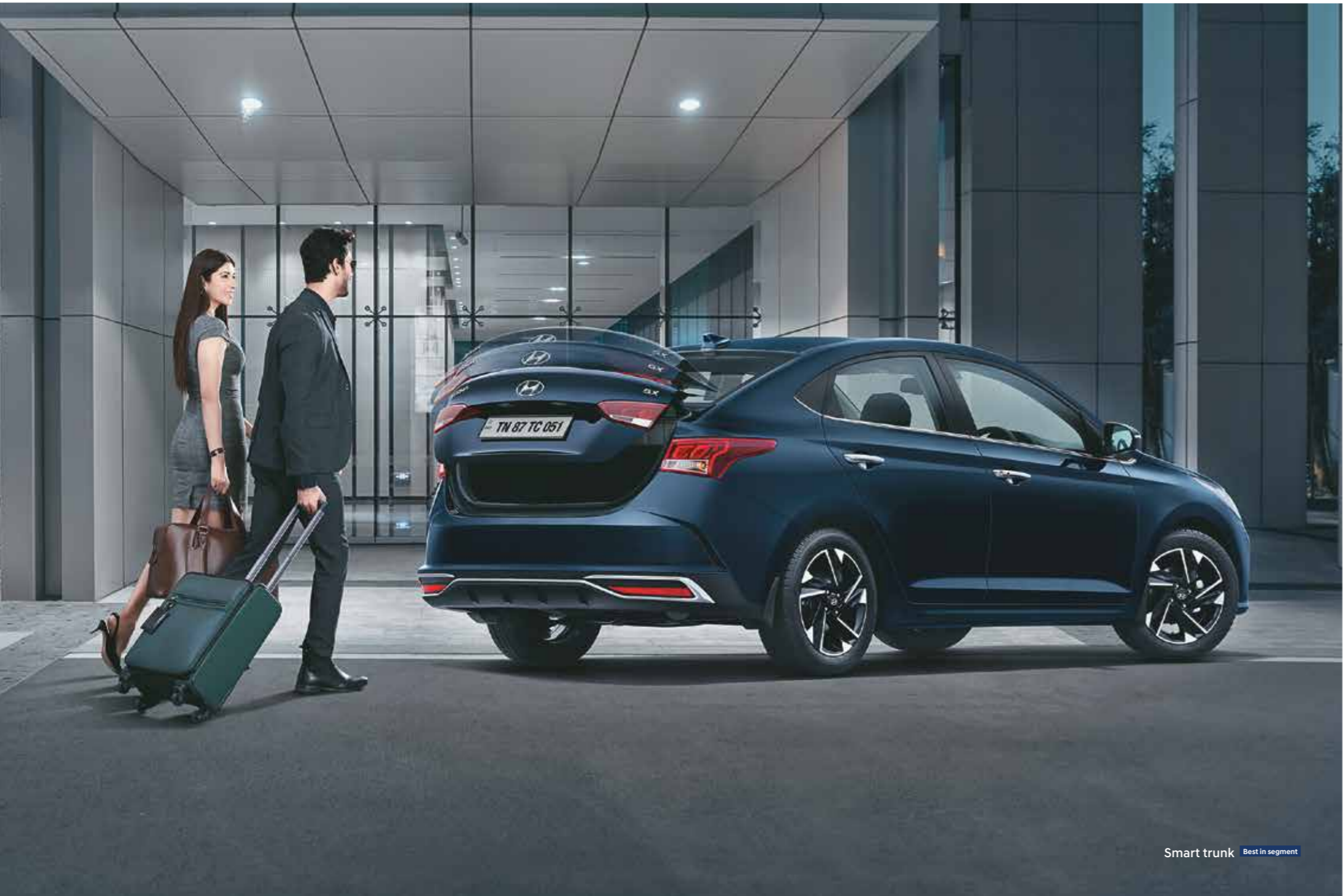
Smart trunk Best in segment