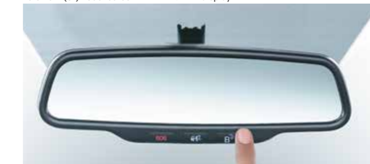
Electro chromic mirror - IRVM with BlueLink switches