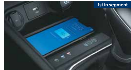
1st in segment