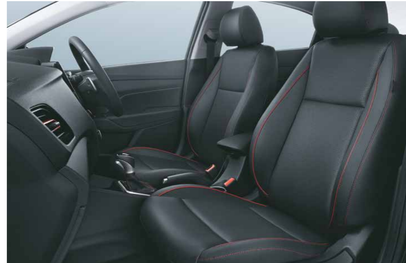
All black interiors with red accents (turbo)

Experience the touch of finesse every time you take a seat in the spirited new VERNA. The new premium dual tone beige & black interiors and all black interiors with red accents (turbo) lend a classy vibe to the cabin, designed to match your killer instinct.