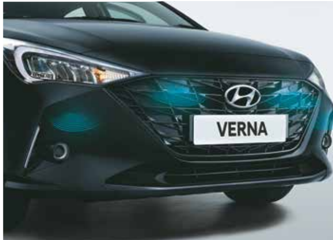
Front parking sensors (turbo)