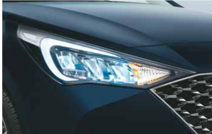
Full LED headlamps