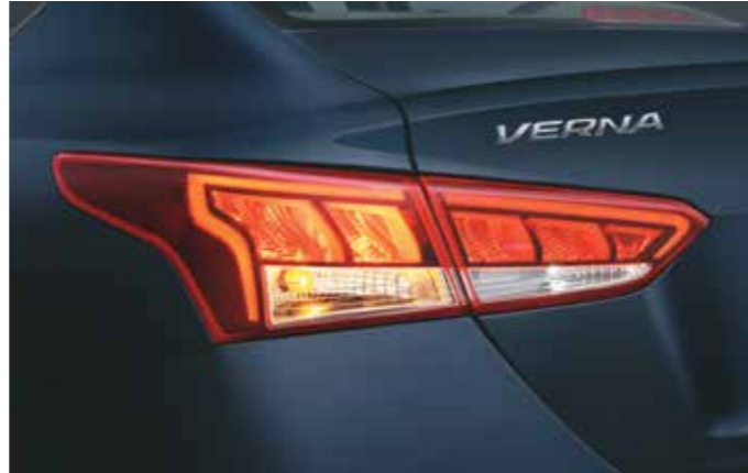
LED tail lamps