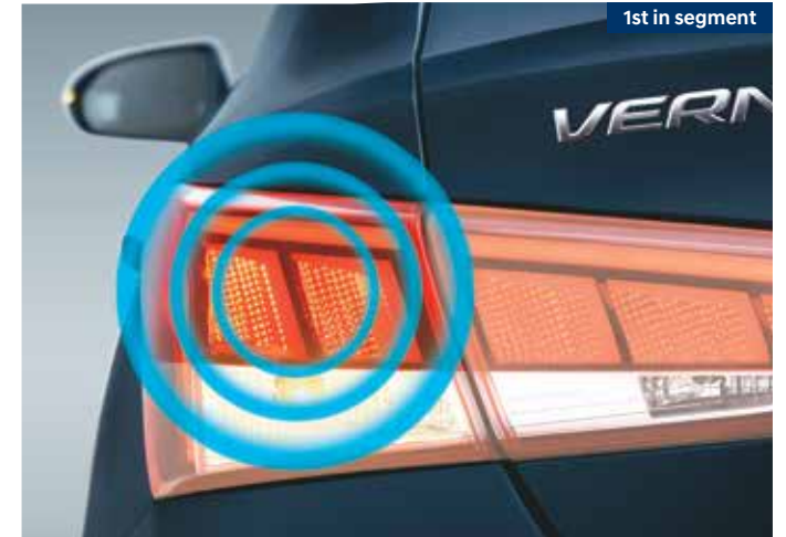
Emergency stop signal (ESS)

Other features: Speed sensing auto door lock | Impact sensing auto door unlock | Strong body structure 73% (AHSS + HSS) | Rear parking camera with dynamic guidelines | Headlamp escort function | Automatic headlamps | Vehicle stability management (VSM) | Electronic stability control (ESC) | Hill start assist control (HAC)