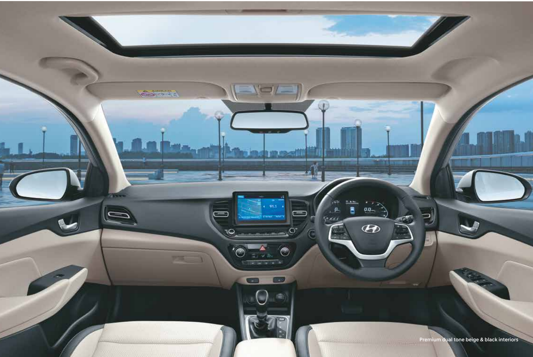
Premium dual tone beige & black interiors