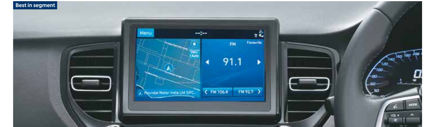
20.32 cm (8") Touchscreen AVNT with HD display