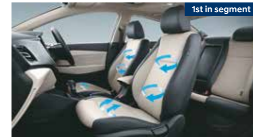
1st in segment