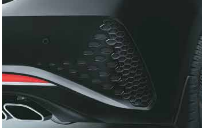
Sporty bumper design (turbo)