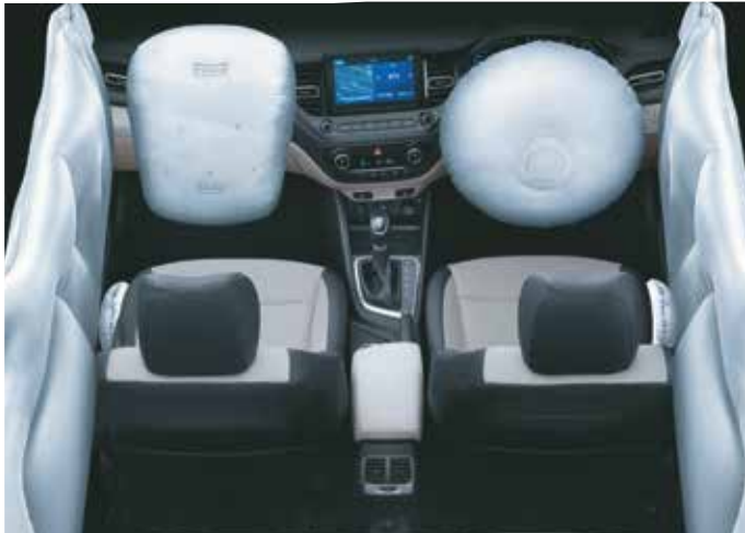
6 Airbags (driver, passenger, front side & curtain)