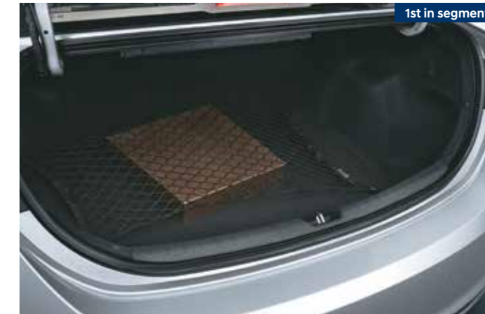
1st in segment