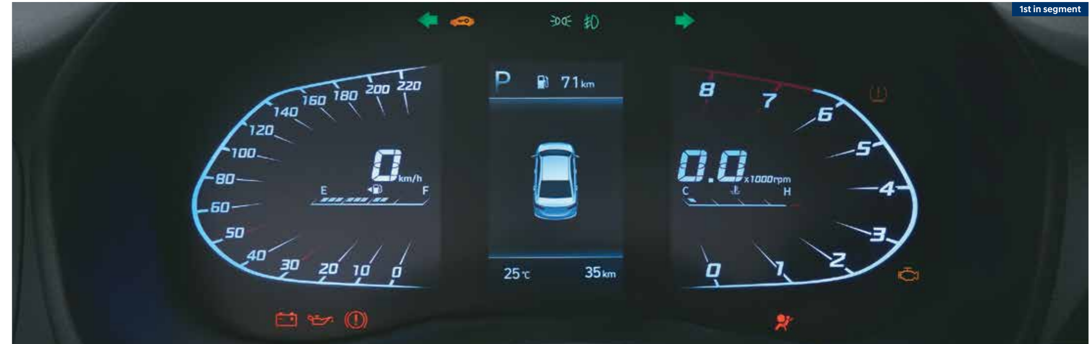
1st in segment

The spirited new VERNA has a ton of features customised to satisfy all your needs. The ingenious new smart trunk to pack all that you love without putting a finger on the boot. Front ventilated seats to keep you cool even in the hot Indian summer. An electric sunroof and a wireless charger to maximise quality time while travelling.