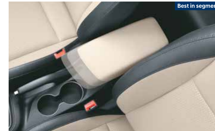
Best in segment