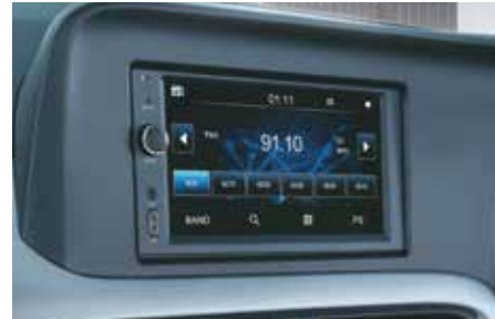
17.14cm (6.75") touchscreen display audio

Other features: 3 Point seat belts (All seats) (Best in segment) | Seat belt reminder (All seats) (Best in segment) | Headlamp escort system | Burglar alarm | TPMS - highline | 6 Airbags