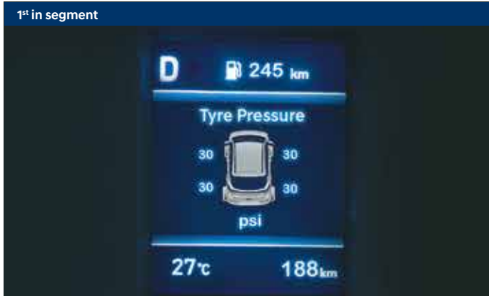
Tyre pressure monitoring system (TPMS) - highline