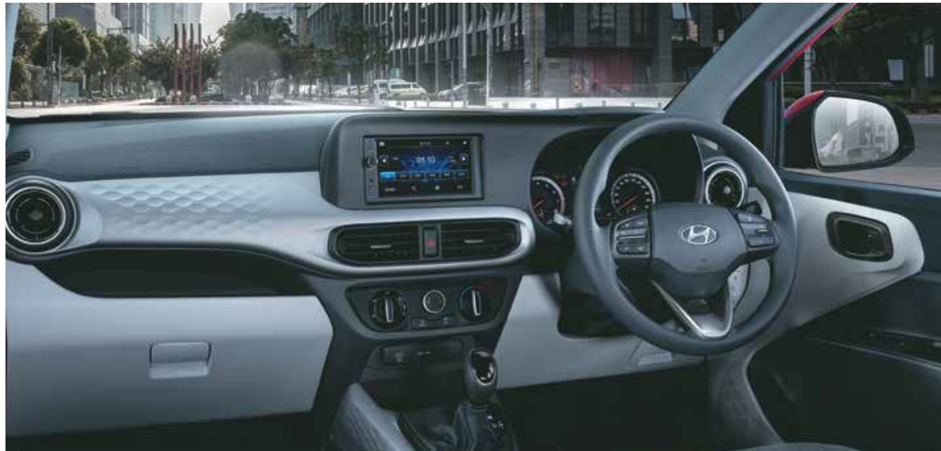
Dual tone grey interiors

Take control of your commute with the Grand i10 Nios corporate trim. Meticulously crafted to enhance your drive while exuding an executive presence. Experience the seamless convergence of technology and design that features a monochromatic black interior punctuated by strategically placed red accents, and gleaming chrome details.