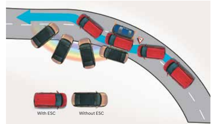
Electronic stability control (ESC) Vehicle stability management (VSM)