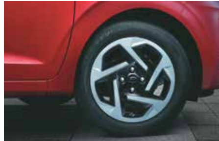
R15 (D = 380.2mm) Dual tone styled steel wheel