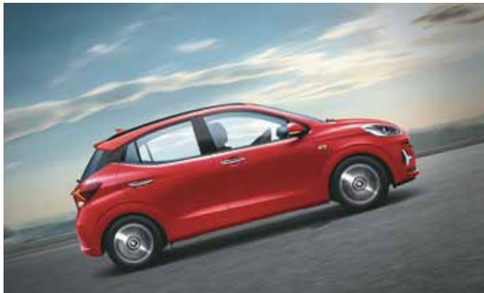
Hill-start assist control (HAC)