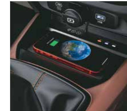
Wireless phone charger^