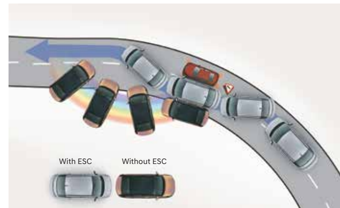
Electronic stability control (ESC) & Vehicle stability management (VSM)