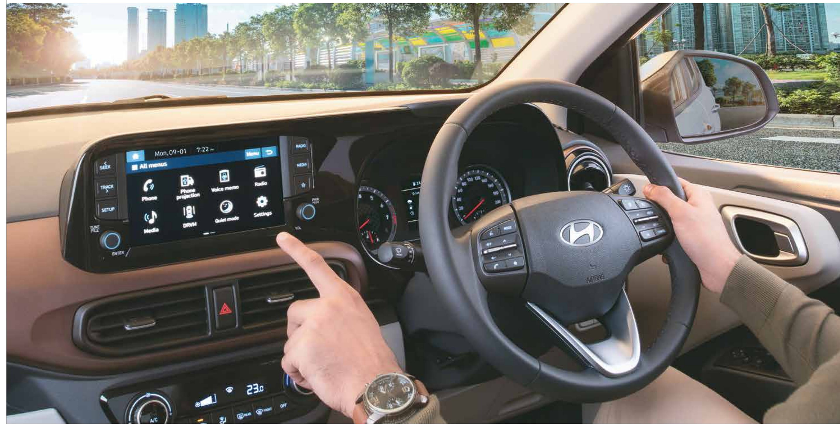
20.25 cm (8") Touchscreen display audio with smartphone connectivity*