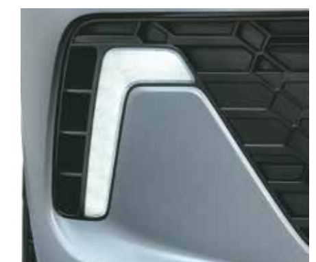
LED daytime running lamps (DRLs)