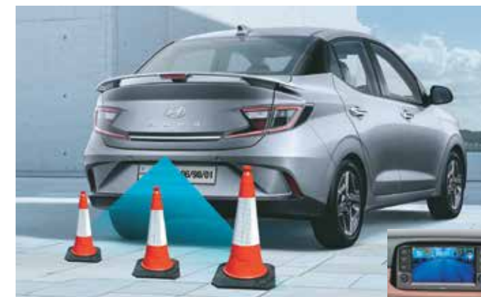
Rear camera with static guidelines