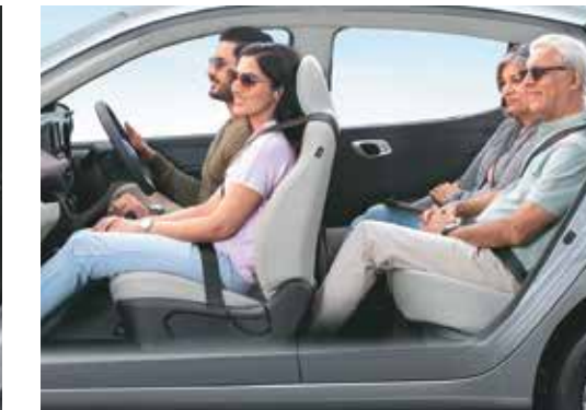
Superior cabin space with ample legroom and thigh support