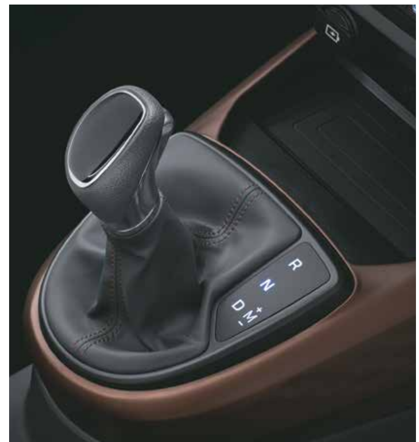
Automated manual transmission (AMT)