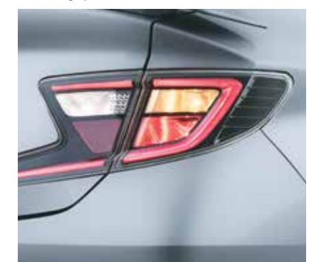
Stylish Z shaped LED tail lamps

Other features: Rear chrome garnish | Chrome outside door handles | Turn indicators on outside mirrors | Shark fin antenna