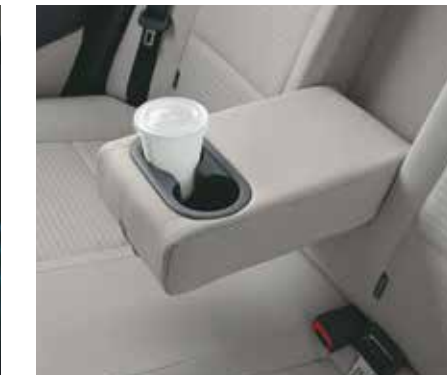
Rear centre armrest with cup holder