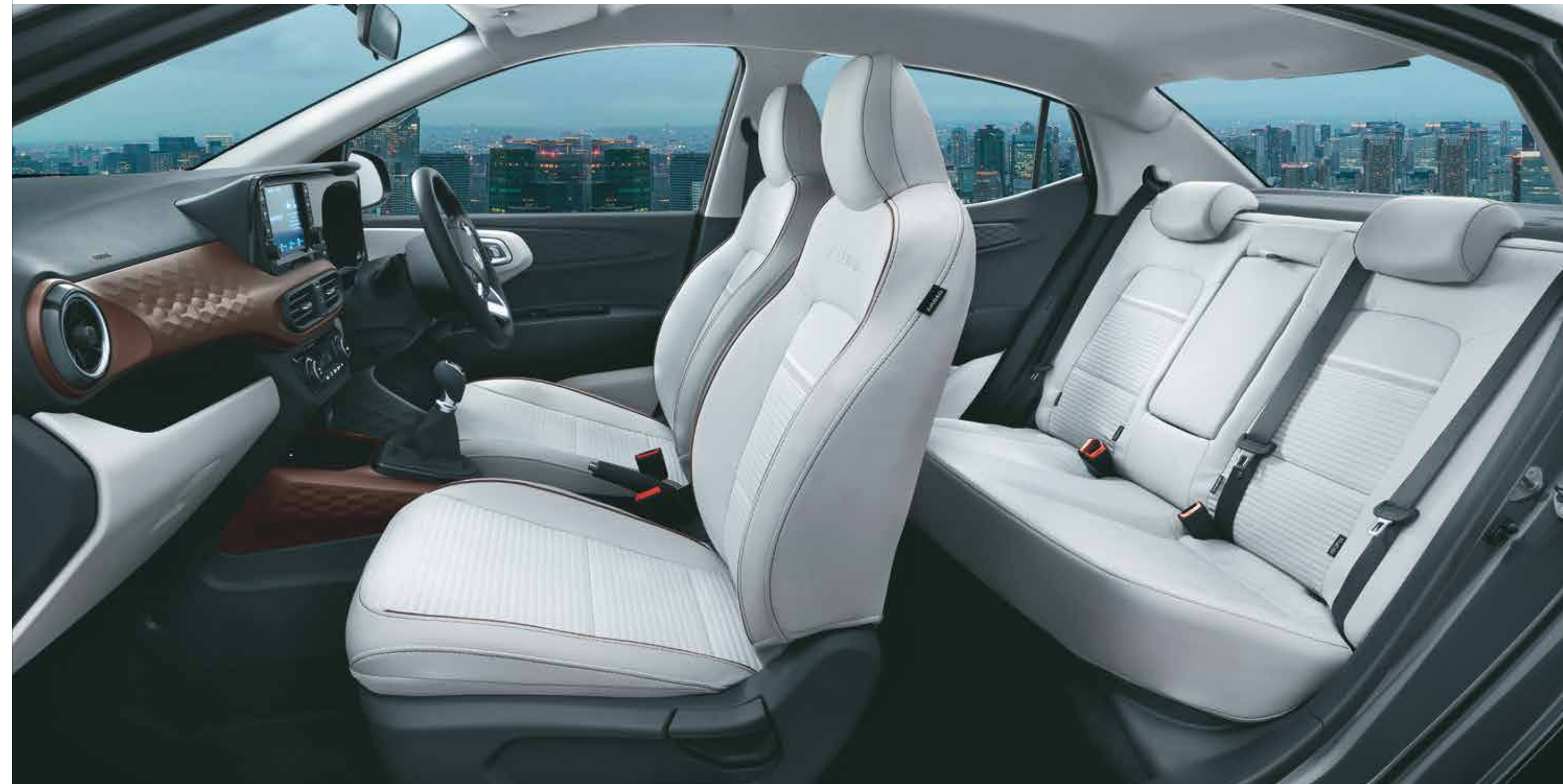
Dual tone grey interiors