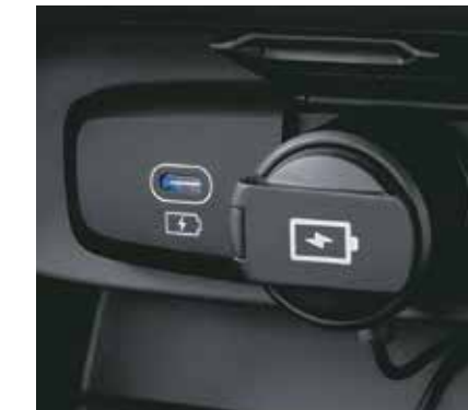
Fast USB charger (Type C)

The interior of Hyundai AURA combines modern aesthetics with contemporary craftsmanship. It is meticulously designed to optimise the space to give the occupants more room and make long journeys as comfortable as short hops across the city.