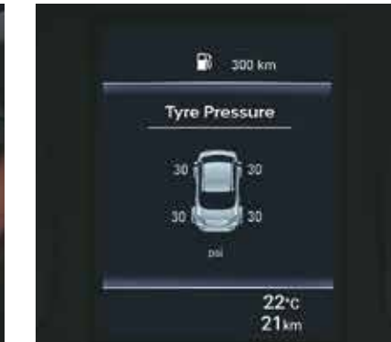
Tyre pressure monitoring system-highline