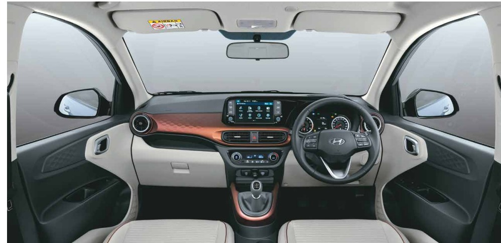
Dual tone grey interior