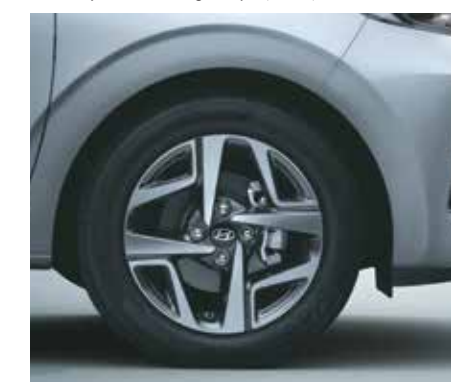
R15 (D = 380.2 mm) Diamond cut alloy wheels