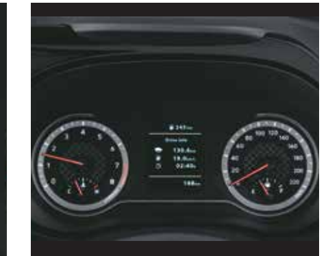
8.89 cm (3.5") Speedometer with multi information display