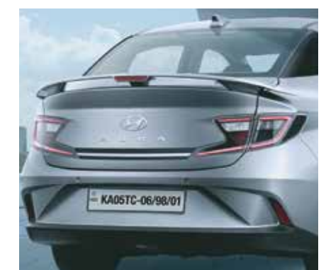
Rear wing spoiler