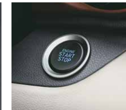
Smart key with push button start/stop