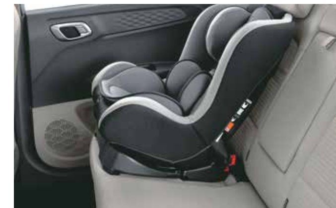
Child seat anchor (ISOFIX)

Other features: Speed sensing auto door lock | Impact sensing auto door unlock | Emergency stop signal