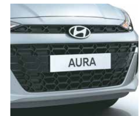
Painted black radiator grille

Hyundai AURA makes an impression from every angle you look at it. The new painted black grille and LED DRLs give it an unmistakable presence and command on the road.